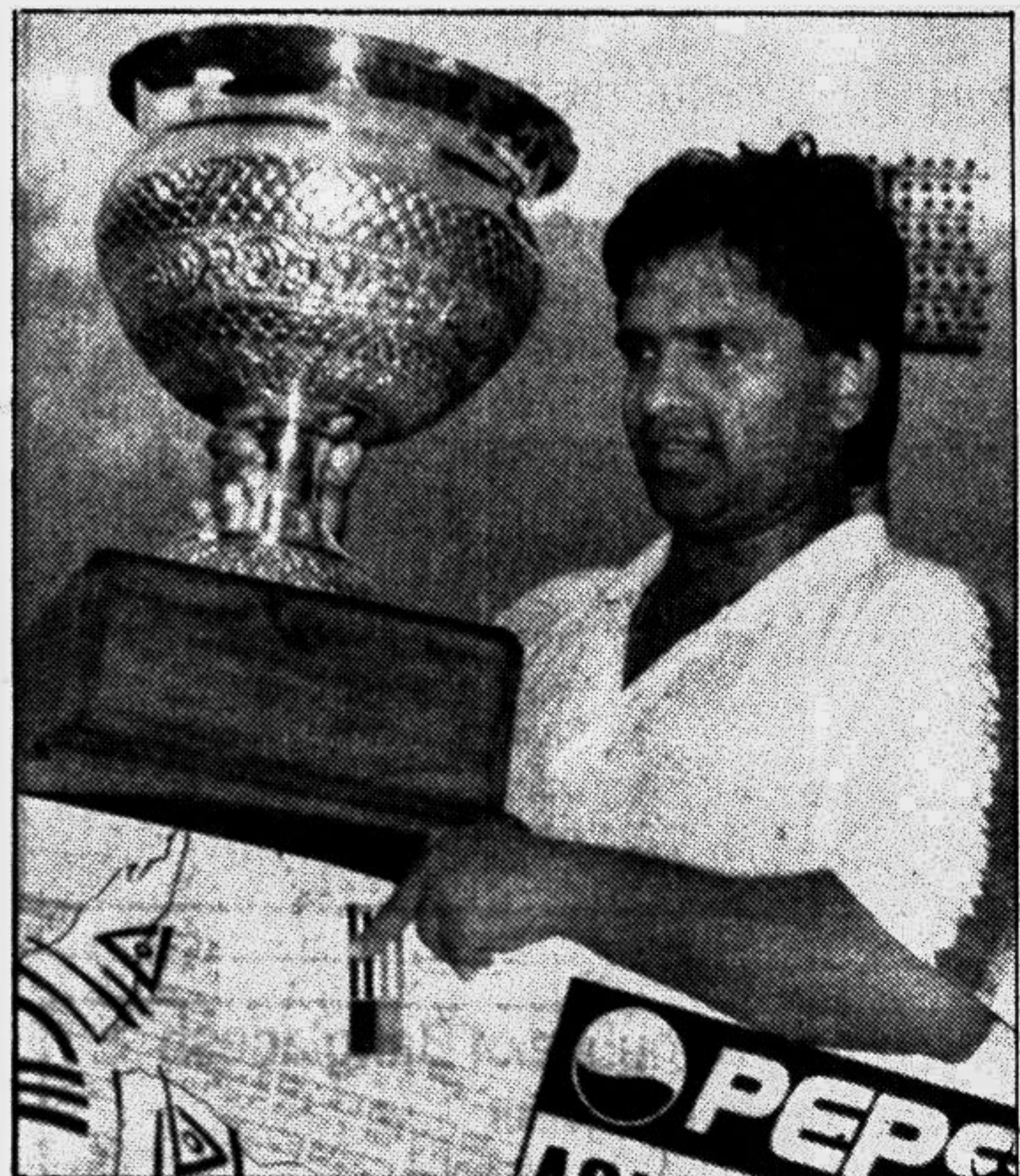
Sri Lankan skipper Arjuna Ranatunga shows the Asia Cup shortly after winning the title by thrashing India to an eight wicket win yesterday at the Premadasa Stadium in Colombo.