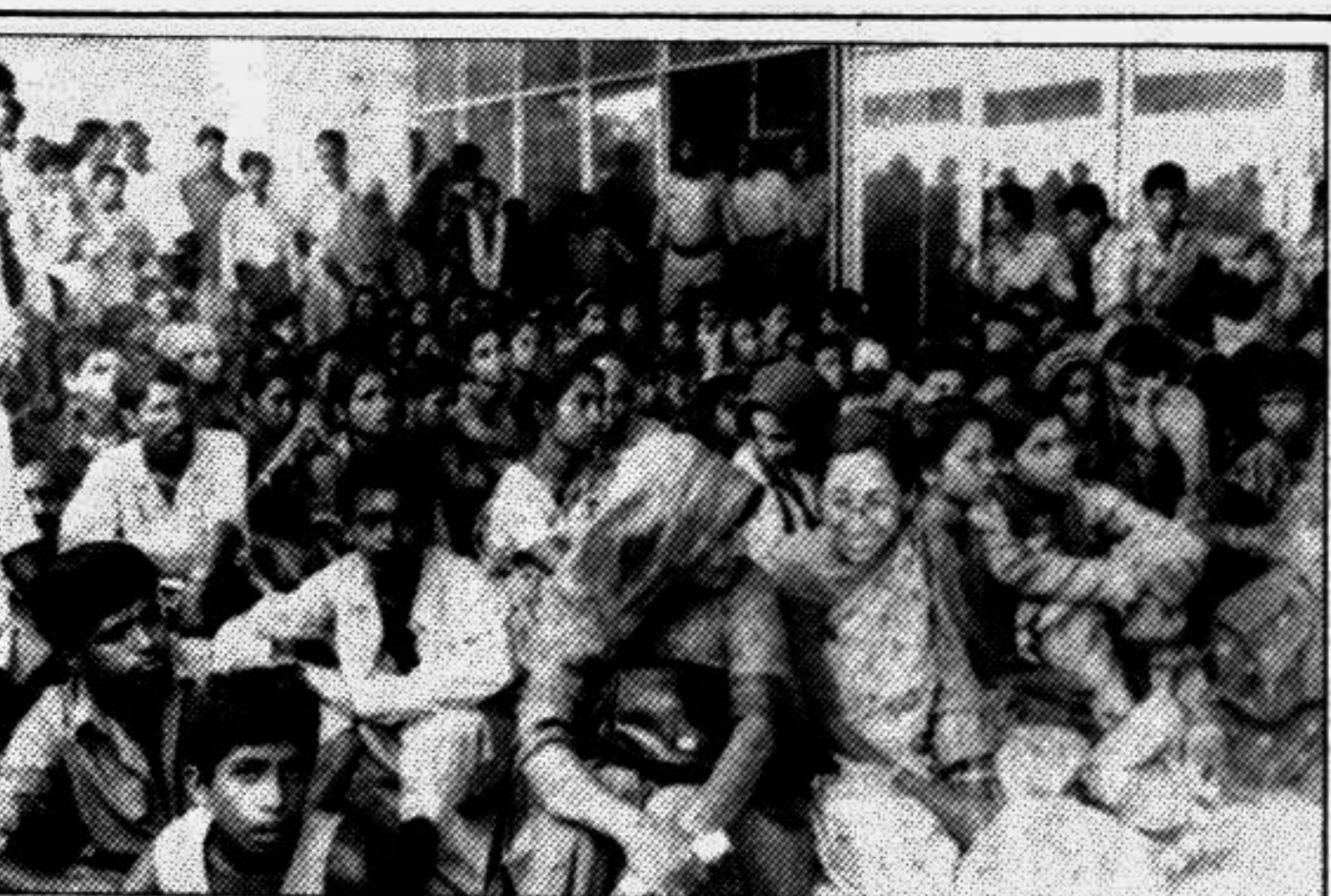
Garments workers staged a sit-in in front of the BGMEA office in the city to press home their demands yesterday.

The company officials said presence of gas-bubbles was now limited within half km-long and quarter km-wide area centering the well. The inflammable bubbles were found mainly in low-lying areas. Such popping gas could not cause a big fire like that of last month, they said.