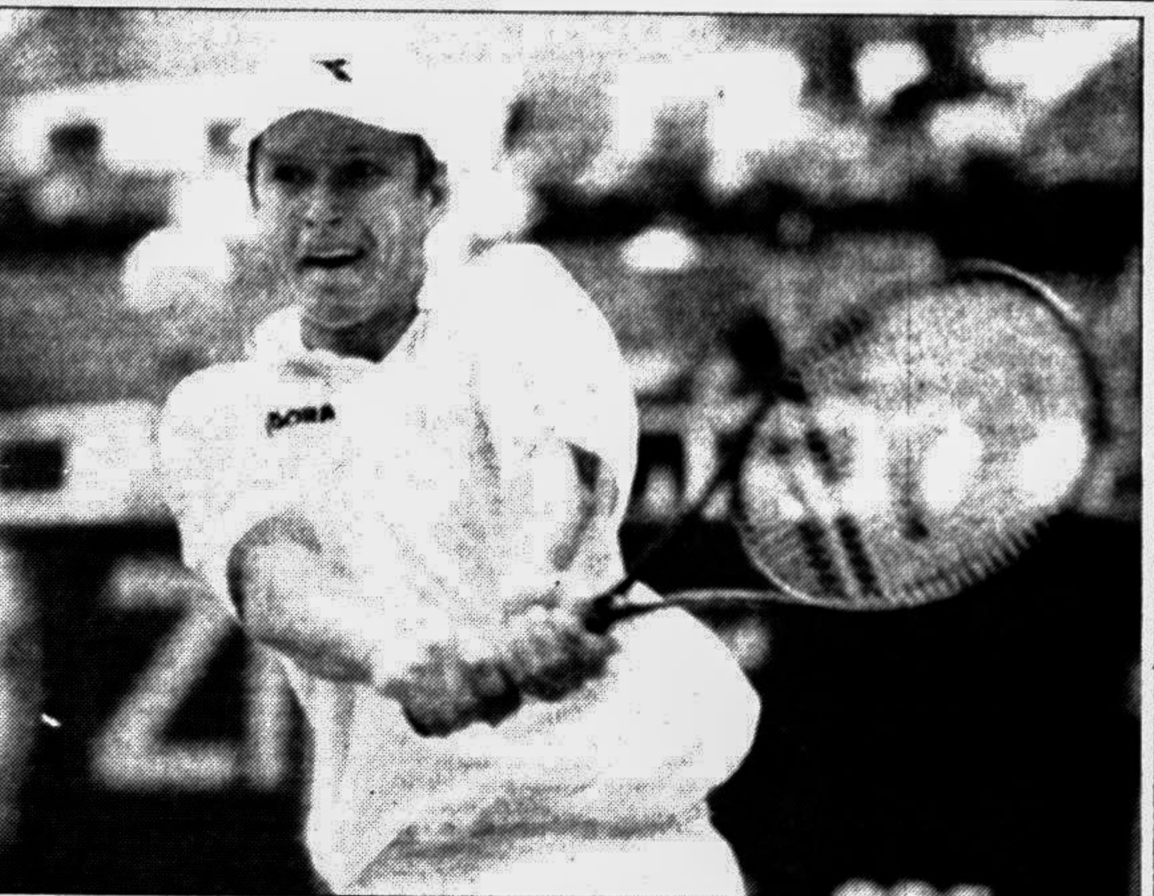
Russian Yevgeny Kafelnikov makes a double fisted backhand return against Fernando Meligeni of Brazil during their second round match at an ATP tournament in Kitzbuehl, Austria on July 23. Kafelnikov won 6-1, 6-3.

"Everyone wants to get into the top 20, the competition is tough. Once you're at the top it's difficult to stay there."