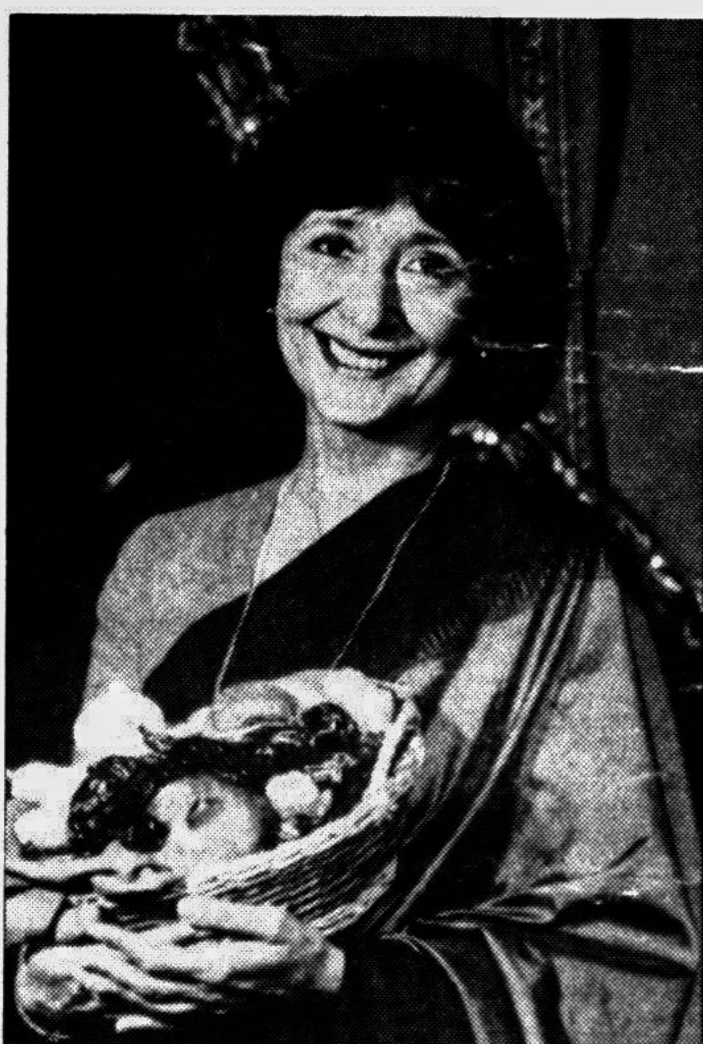
Madhur Jaffrey's Flavours of India, every Wednesday at 8:30 pm