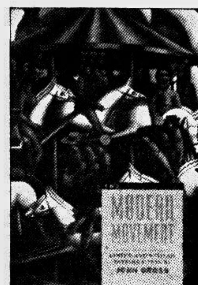
The Modern Movement

Sarah Cleveo suffers a psychological crisis being perpetually misappropriated by the men in her life. Finally she lashes out on her enemies breaking every myth about women's vulnerability. A powerful and engaging novel focusing on the difficulties of a modern woman's predicament.