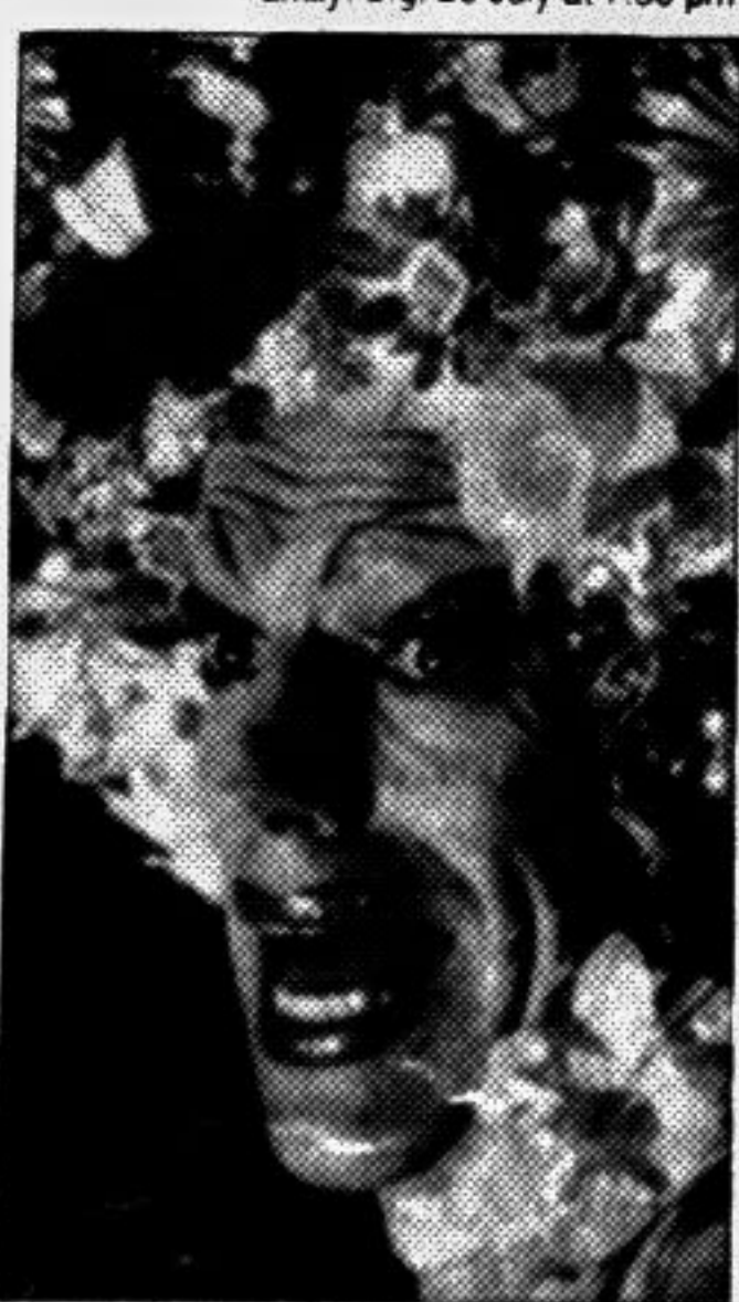
Comedy The Adventures of Priscilla, Queen of the Desert, 27 July at 2:00 pm