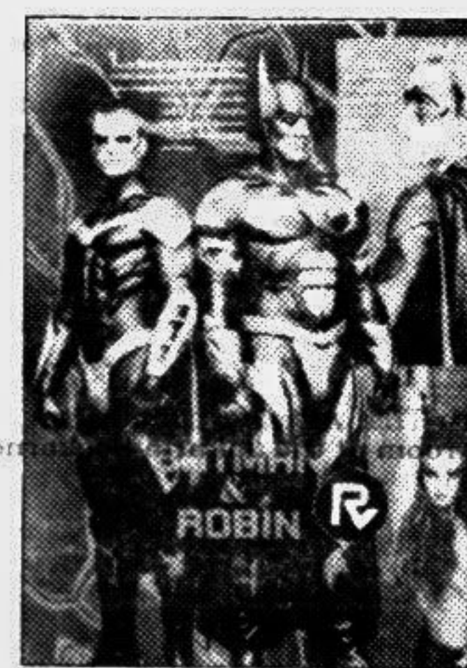
Batman & Robin

Starring : George Clooney, Chris O'Donnell Alicia Silverstone