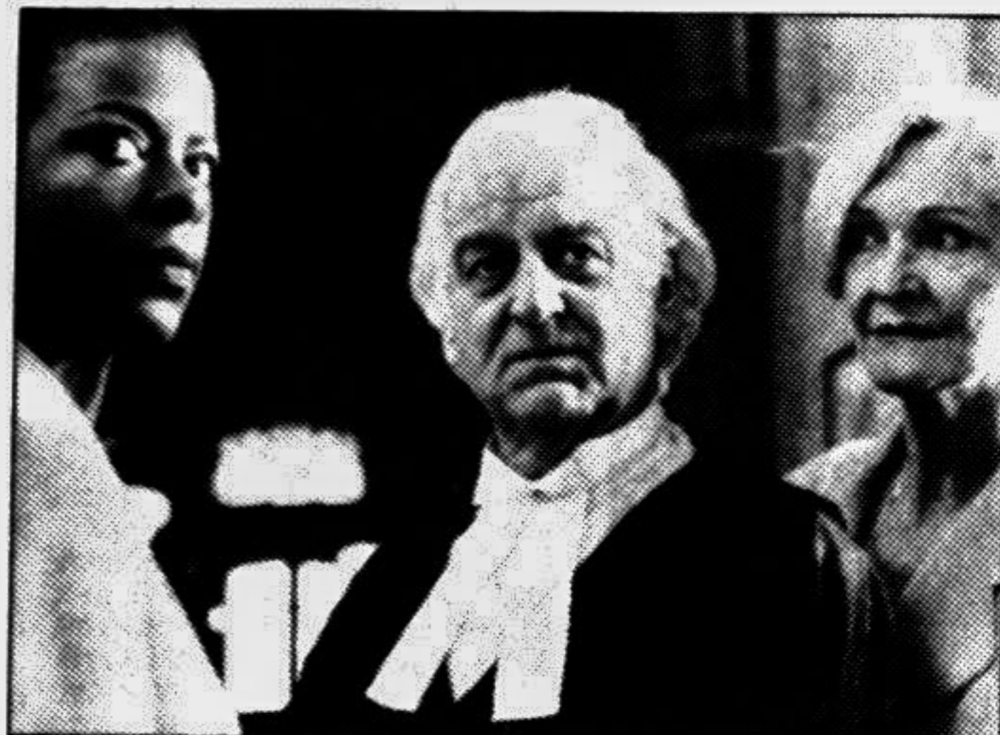
Mystery Movies: Kavanagh QC July 26th at 12:30 pm on Star Plus

In Blood Money, when surgeon Hilary Jameson leaves the theatre having successfully operated on a computer tycoon involved in a car accident, she has every reason to suppose that he'll soon be on the mend. Within a matter of minutes, however, his wife, Sarah Meadows, learns that he is dead. After the coroner agrees that her husband died of a heart attack, Sarah approaches Kavanagh to pursue action for negligence against the surgeon and hospital trust.