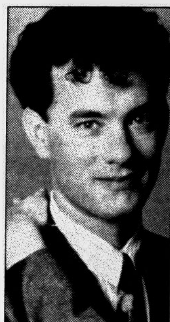
Family Big 26 July at 7:30 pm