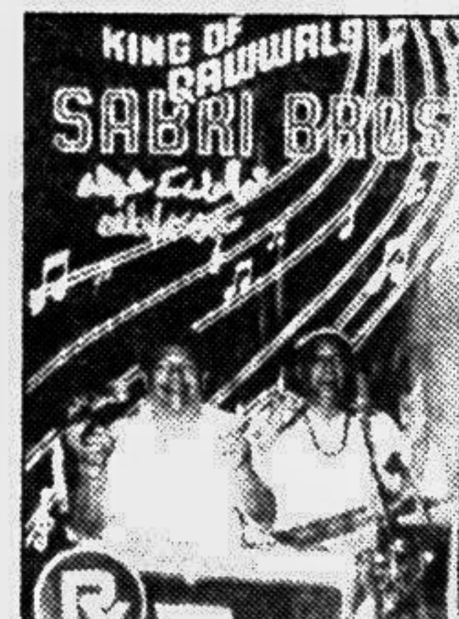
King of Qawwals

Starring : Nicolas Cage, John Cusack, John Malkovich Musical