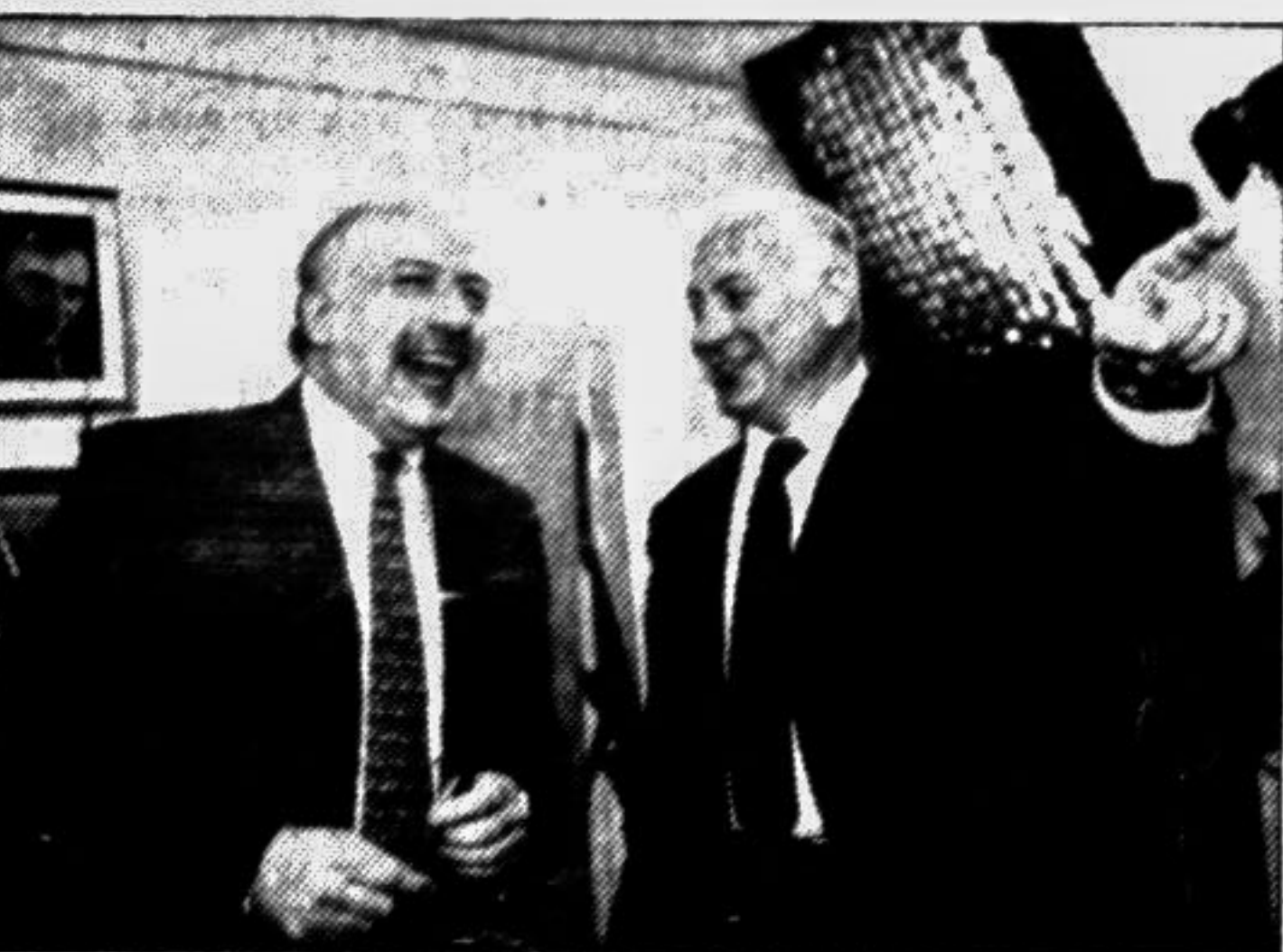
Hardlak every Monday to Friday at 9:30 pm