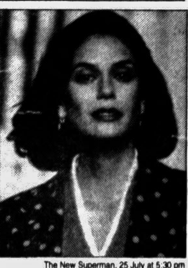
The New Superman, 25 July at 5:30 pm

Morning session Saturday July 26 10:30 Asia Cup Cricket '97 live: Final Evening session 9:00 Rotocap Sunday July 27 3:20 Woody Woodpecker 6:30 National TV Debate 7:25 Mat-o-Manush 8:30 Chhaya Chhanda 10:25 Hercules