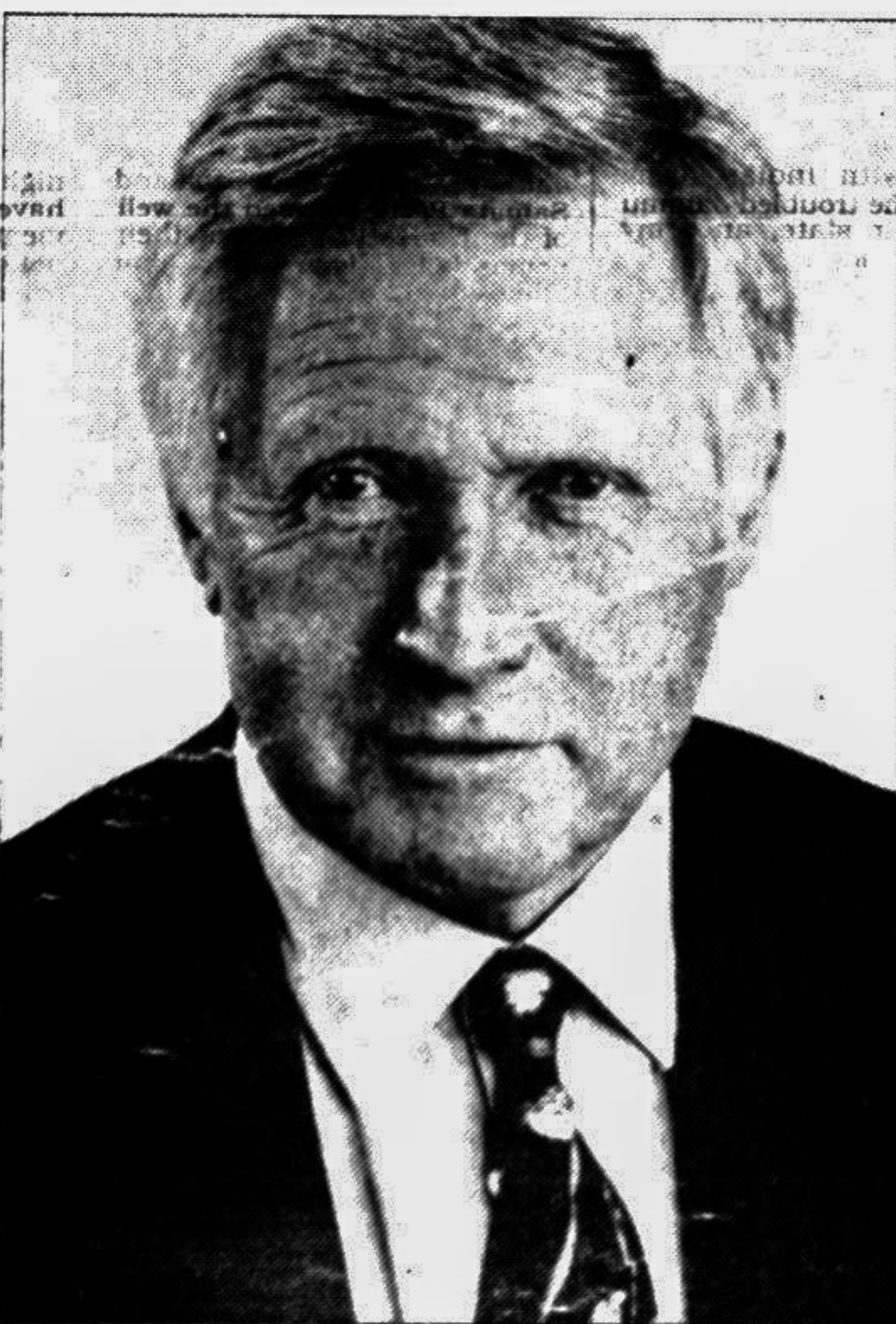
After the Raj-host David Dimbleby, 30 Aug 3:05 pm and 7:05 pm