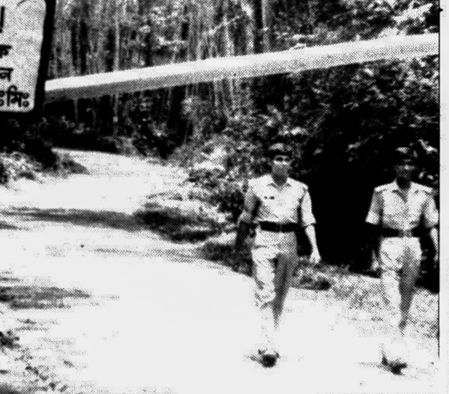
Speed limit has been imposed on vehicles plying on roads passing by Magurchhara gasfield area.