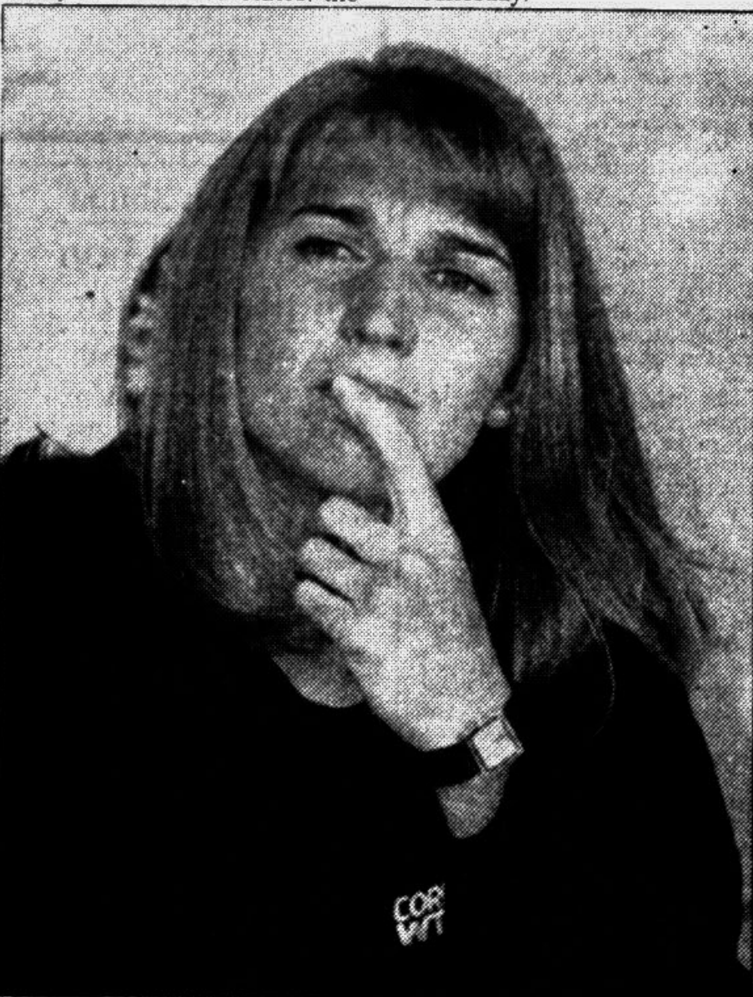
An AFP file photo shows former World No 1 tennis star Steffi Graf in Paris during this year's French Open.

New York and Florida, was already in the United States, the president's office confirmed Wednesday.