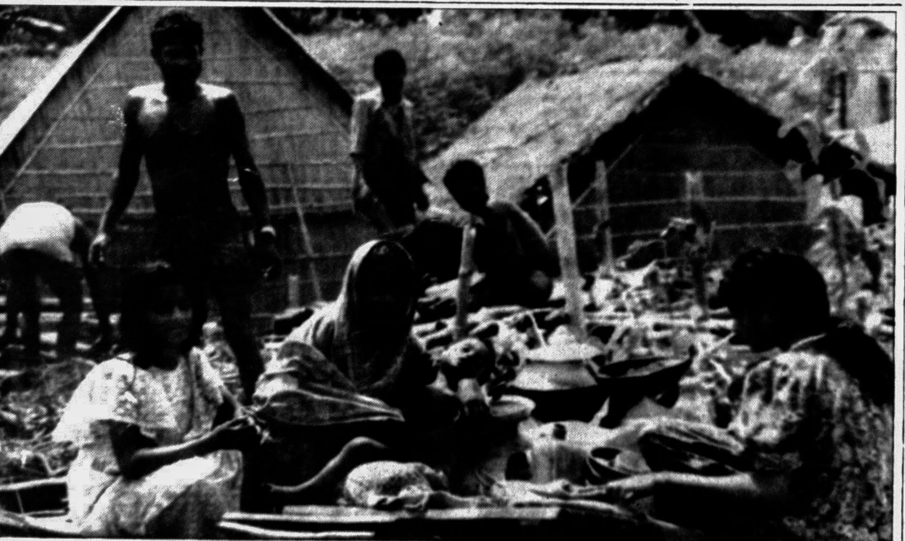
MANIKGANJ: A vast tract of land under Nesarganj union of Harirampur thana in the district has been devoured by river. Now the villagers of the affected union living under open sky.

A private car driver told this correspondent that with the opening of Kushtia-Rajbari road the distance between Kushtia and Dhaka has become only 110 miles instead of 155 miles.