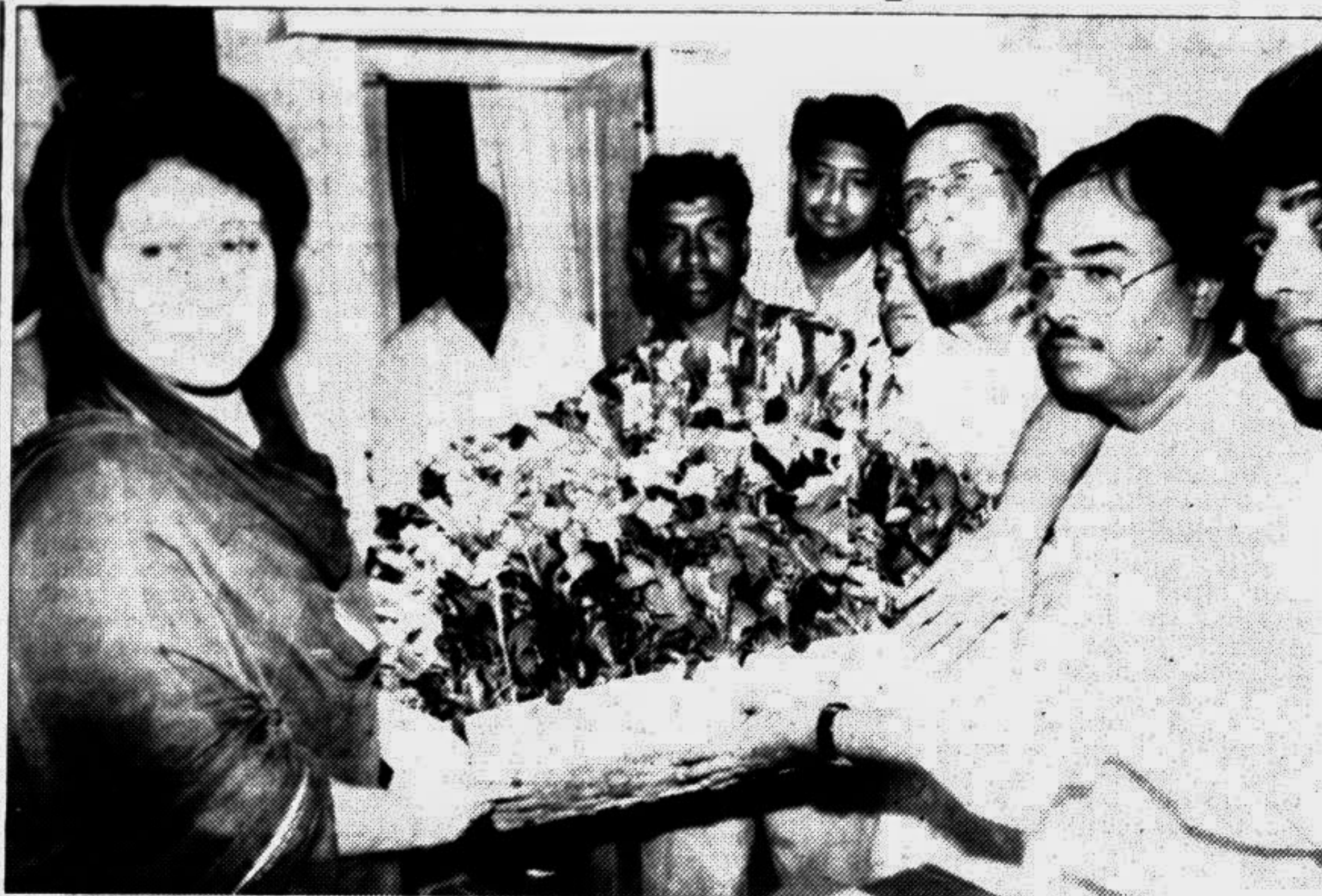
Leaders of Shahid Zia Smriti Sangsad presenting a bouquet to leader of the Opposition and BNP chairperson Begum Khaleda Zia at 29, Minto Road yesterday.

words of encouragement and support that the Staff Association and the Administration of the WHO urge and pray for the Law and Order Institutions of this country to bring the culprits to justice.