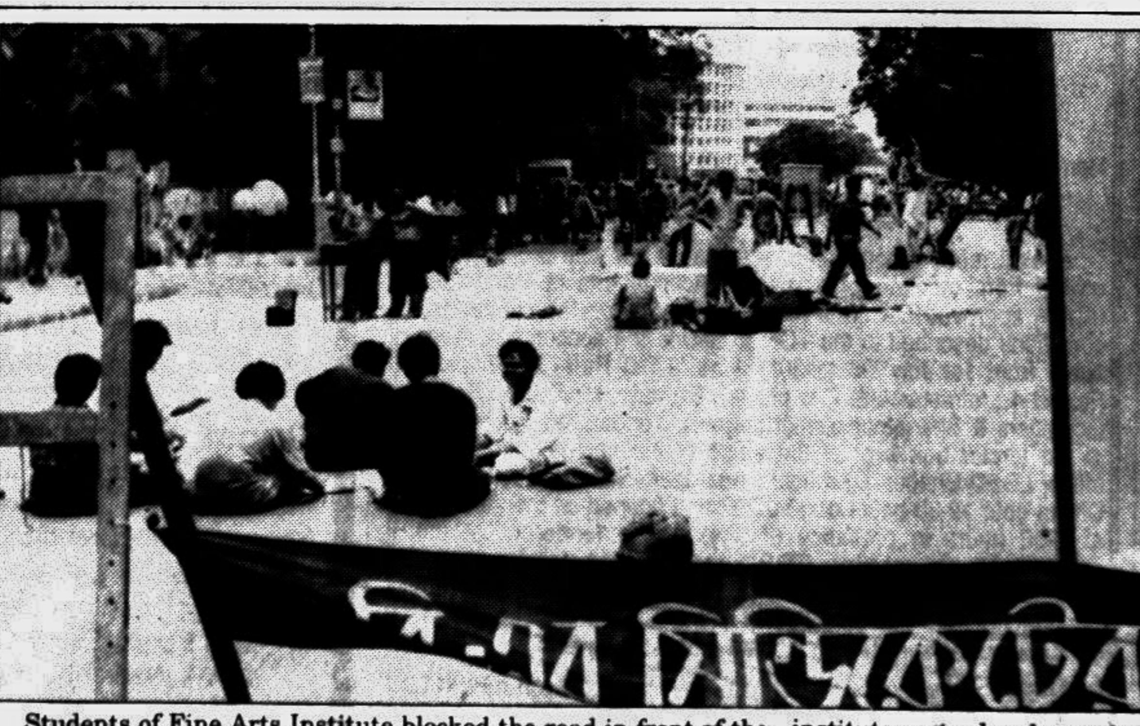
Students of Fine Arts Institute blocked the road in front of the institute yesterday demanding upgradation of Shaheed Shah Newaz Bhaban into a full-pledged dormitory.