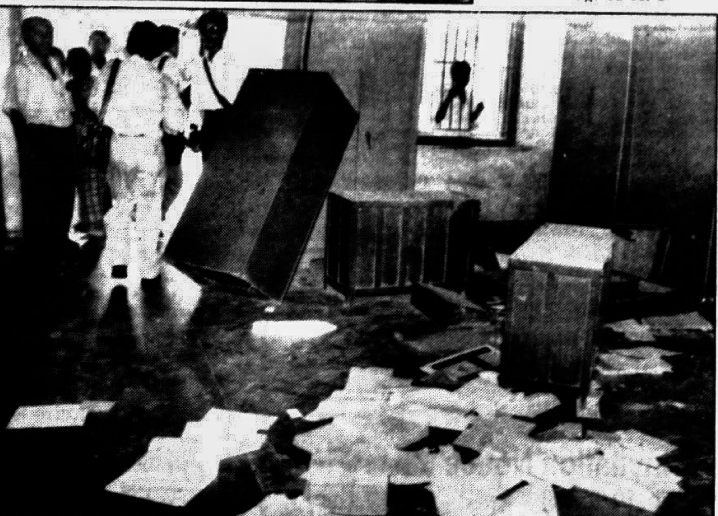
A student injured during the clash, being rescued by police (top) and a view of the ransacked office room of Eden Girls' University College (bottom).