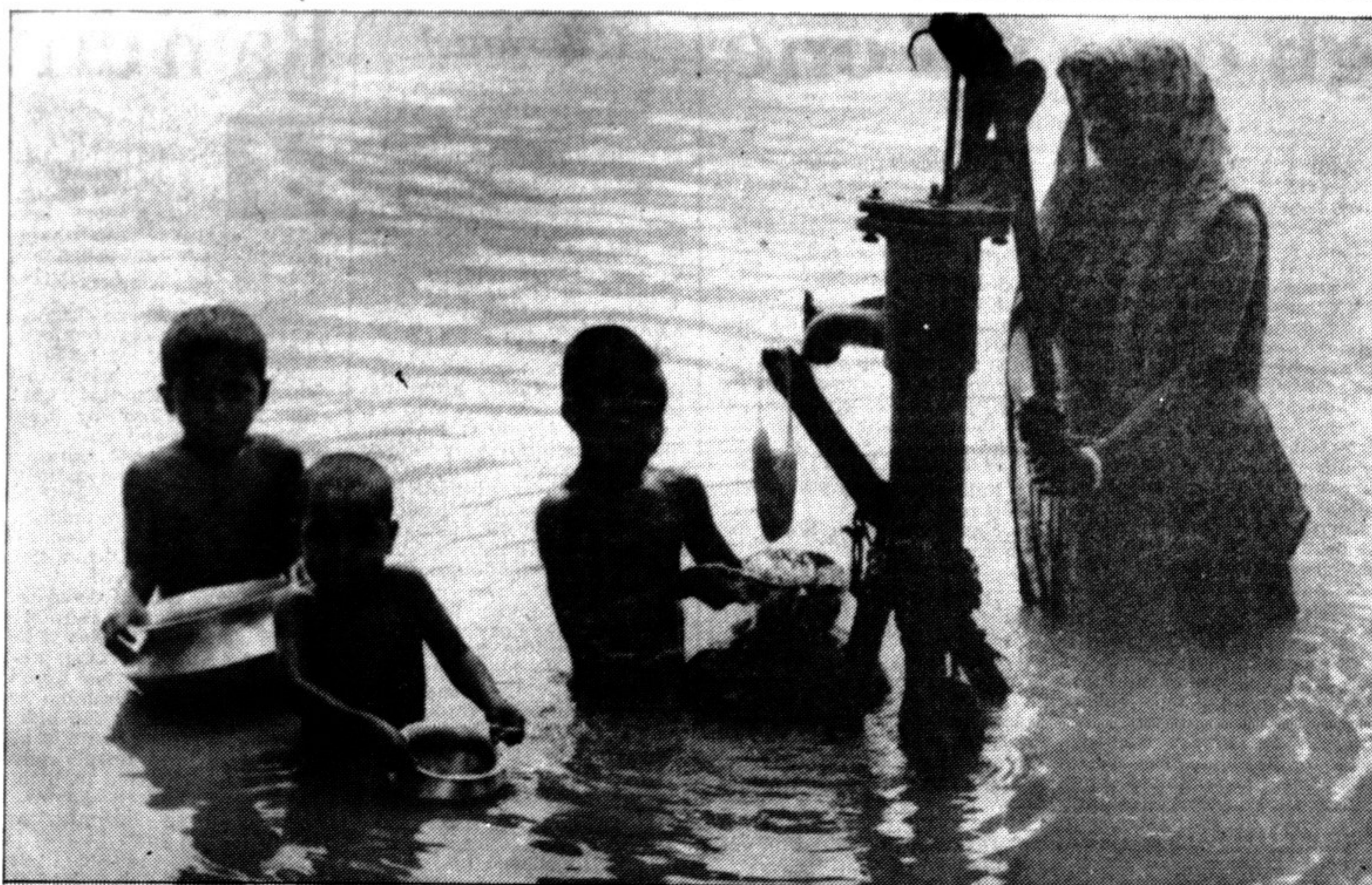
MANIKGANJ: Acute scarcity of drinking water has been prevailing in flood affected areas of the district. The people of flood-hit village Nabayankandi under Harirampur thana in the district collecting drinking water from a nearby tubewell.

SIRAJGANJ, July 21: Wheat worth Tk 2,35,52,600 have allegedly been misappropriated from the vulnerable group distribution (VGD) programme in the district in the last 12 months, reports UNB. A survey conducted recently by a non-government organisation revealed that 19,770 VGD cards were distributed among the destitute mothers of 79 unions in nine thanas allocating 30 kg of wheat to each card holder every month. But it was found that only 20 kg of wheat instead of 30 kg have been given to a card holder and the remaining huge amount of wheat was sold in the black market — thus earning Tk 15,81,600 every month.