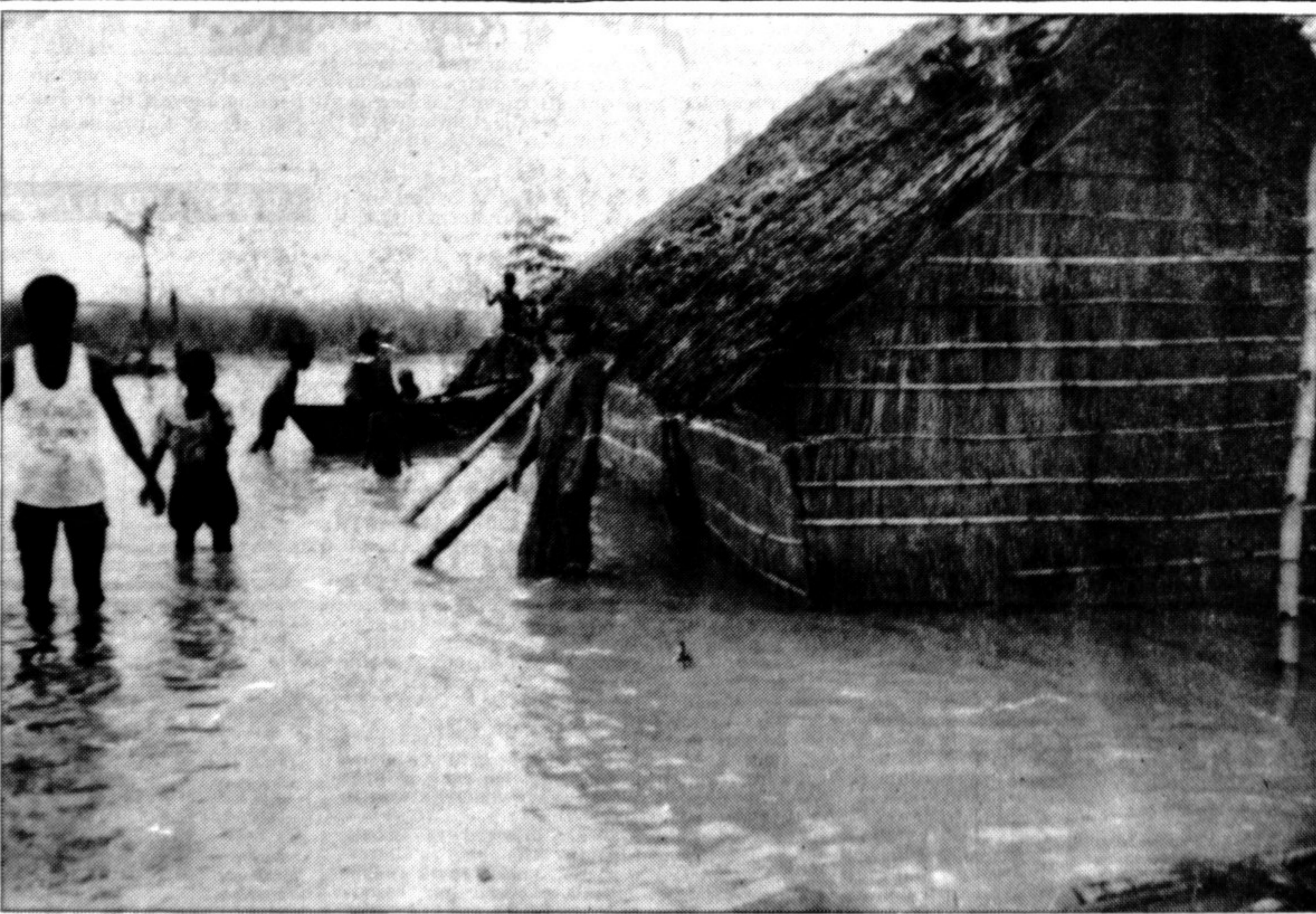
GAIBANDHA: A flood affected family of village Nabidanga under Fulchhari thana