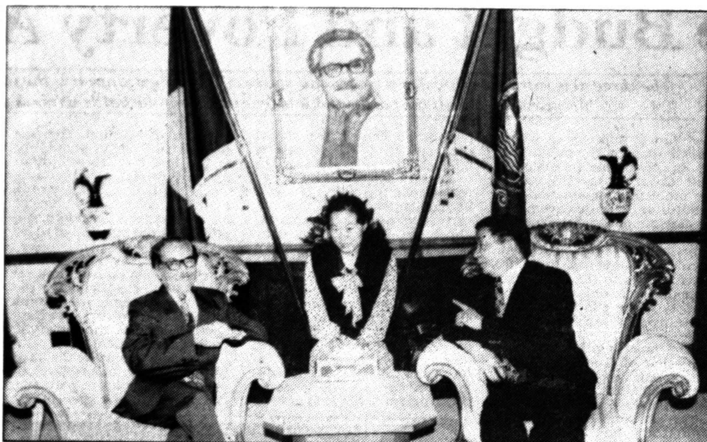
Visiting Deputy Procurator General of the Chinese Supreme People's Procuratorate Wang Wenyuan called on President Justice Shahabuddin Ahmed at Bangabhaban yesterday.