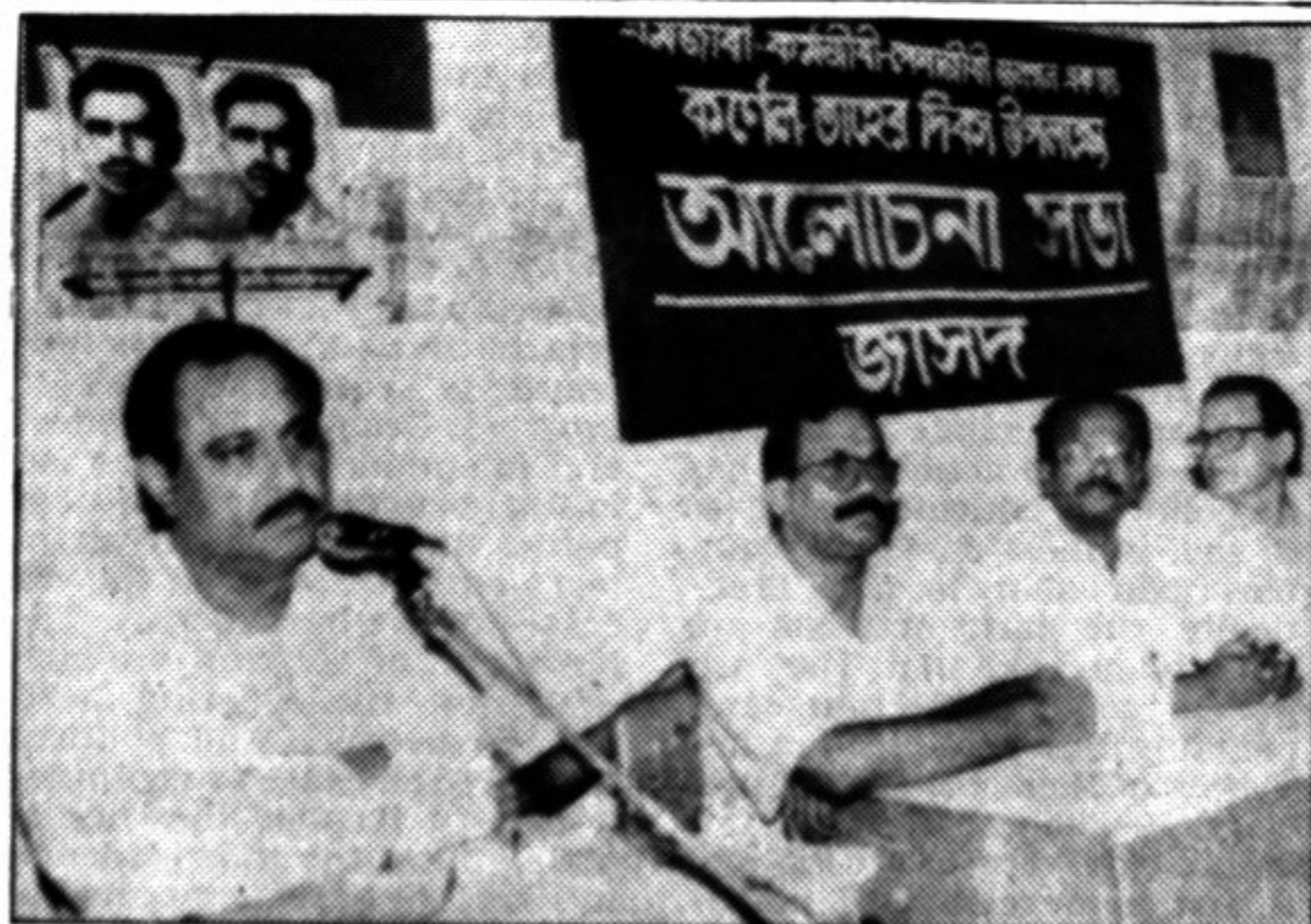
Shipping Minister and Secretary General of Jatiya Samajtantrik Dal (JSD) A S M Abdur Rab speaking at a discussion marking the death anniversary of Col Taher in the city yesterday.

It said there must be a financial audit and complete evaluation of expenses in the project to-date, and people's participation must be ensured in all stages of water resources management.