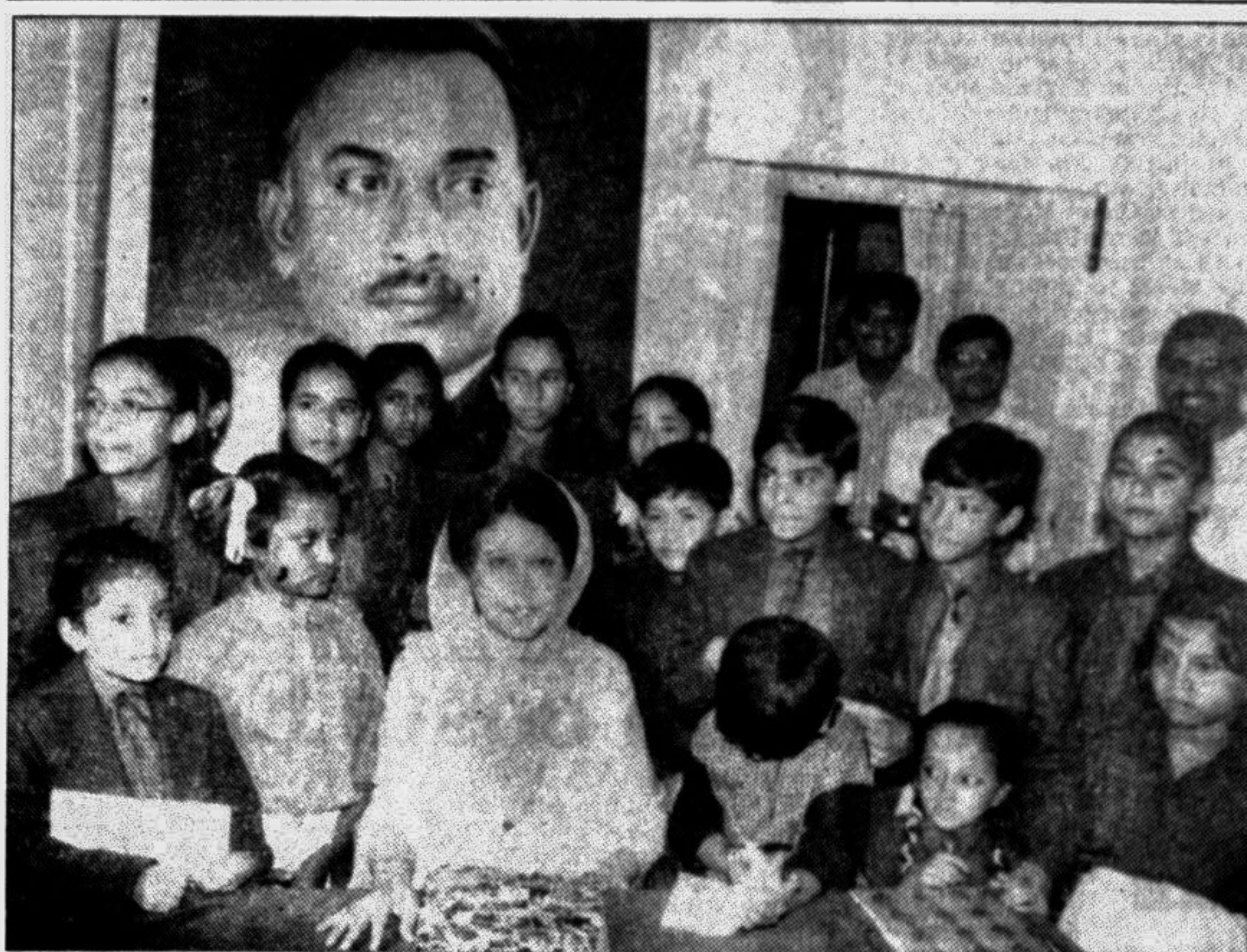
Leader of the Opposition and BNP Chairperson Begum Khaleda Zia with the members of Zia Shishu Kishore Sangathan who met her at her official residence in the city yesterday on return from their visit to Ankara.