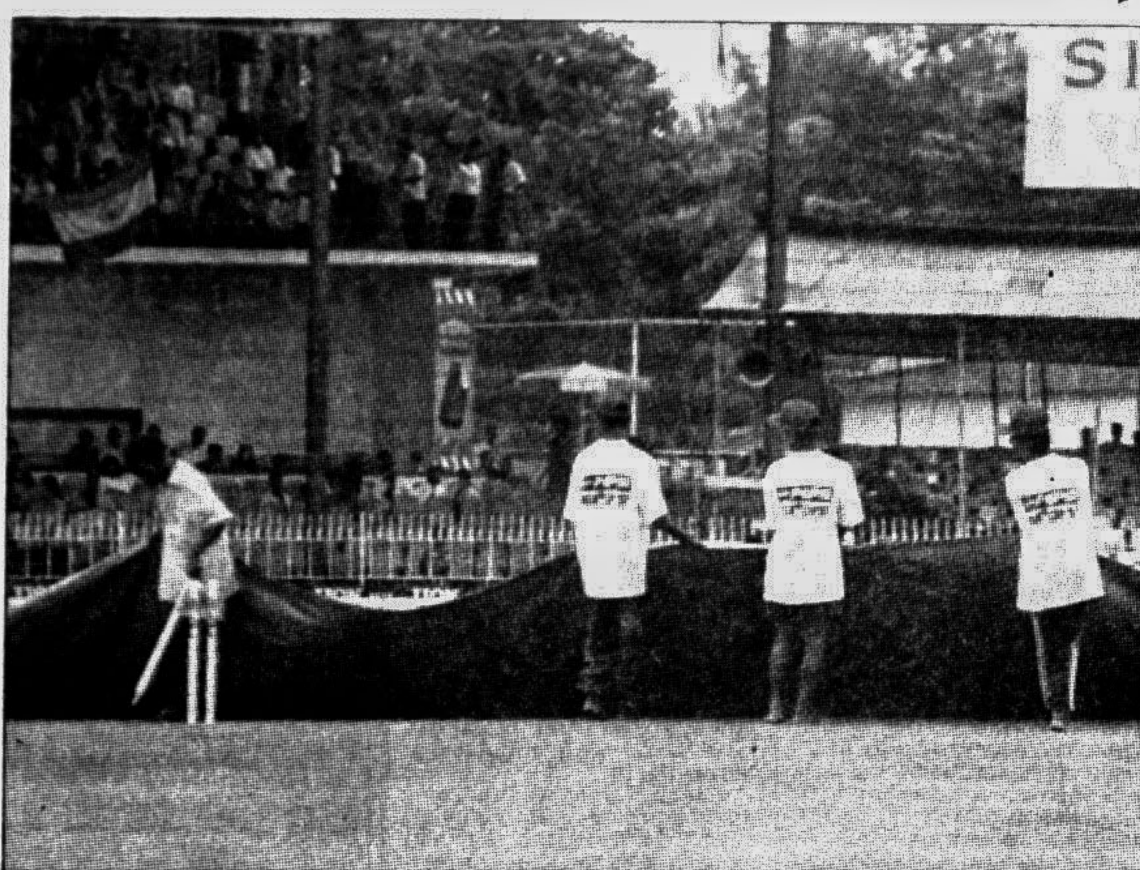
Groundsmen bring out the covers as rain spoils the India-Pakistan match in their Asia Cup encounter in Colombo yesterday.

The Kuwaiti cited the 1990 World Cup success as an example for the city's ability to handle big sports events.