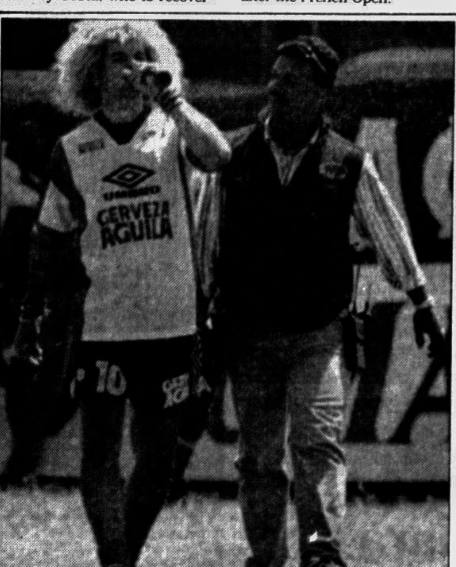
Colombian soccer star Carlos Valderrama, escorted by a body guard, leaves the field after a light practice prior a World Cup qualifier against Ecuador in Barranquilla on Sunday.

Rosmalen, Holland in 1995. Corretja was never threatened by Costa, who is recovering from a back injury which sidelined him for several weeks after the French Open.