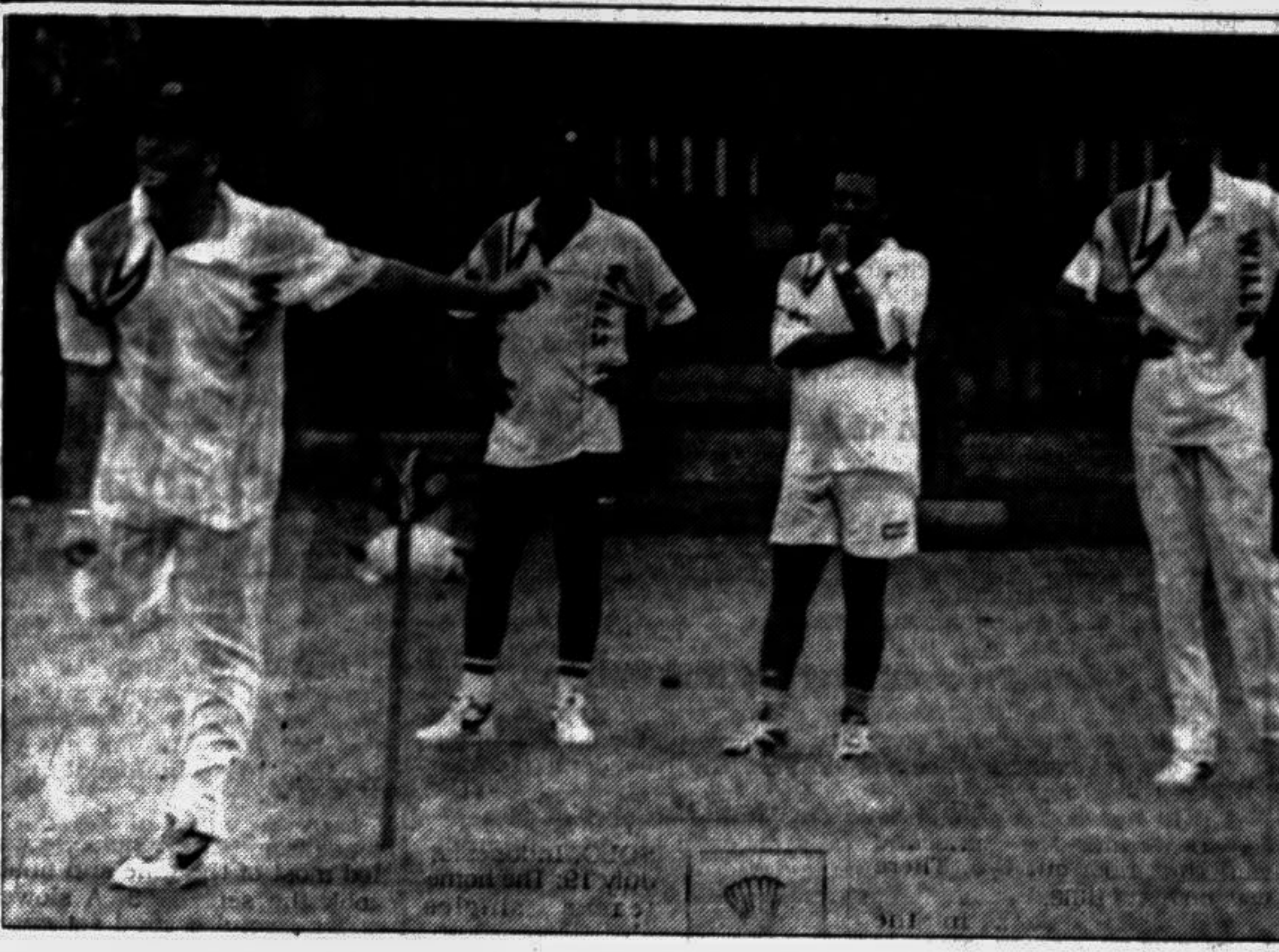
Indian captain Sachin Tendulkar (L) works on his bowling while coach Madan Lal (2nd from right) and teammates look on at a practice session in Colombo yesterday. India take on arch-rivals Pakistan in a crucial Asia Cup match in the Lankan capital today.