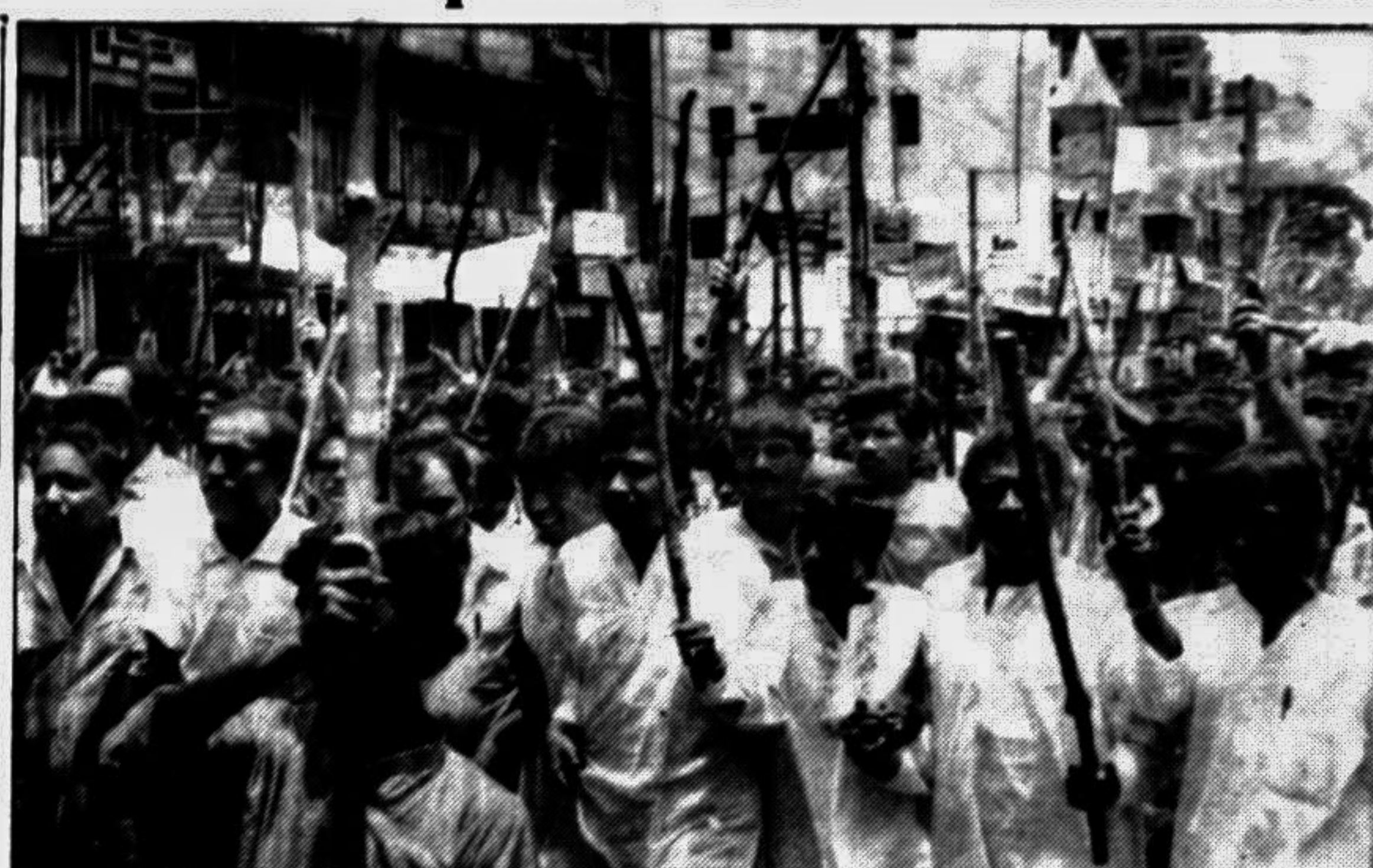
Jatiya Samonnaya Committee brought out a rally in the city yesterday protesting a planned march by certain Islamic groups towards 'Shikha Chirantan'.