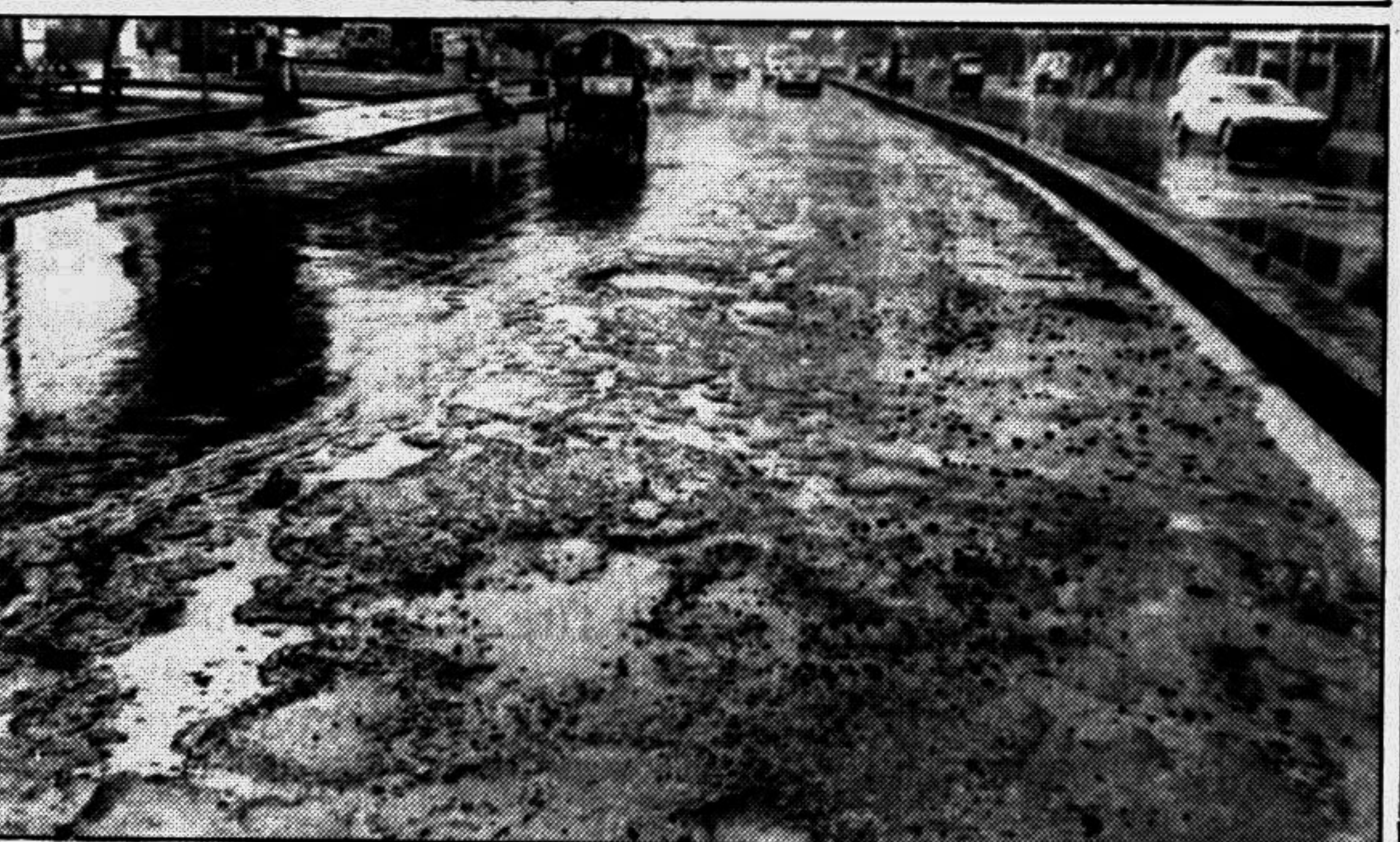
Incessant rain over the past week has washed away the top layer of most city roads, leaving them in a mess. Another spate of shower may turn the roads into canals unless they are repaired quickly. But the city corporation is yet to take up the repairs, the cost of which is expected to run into crores.