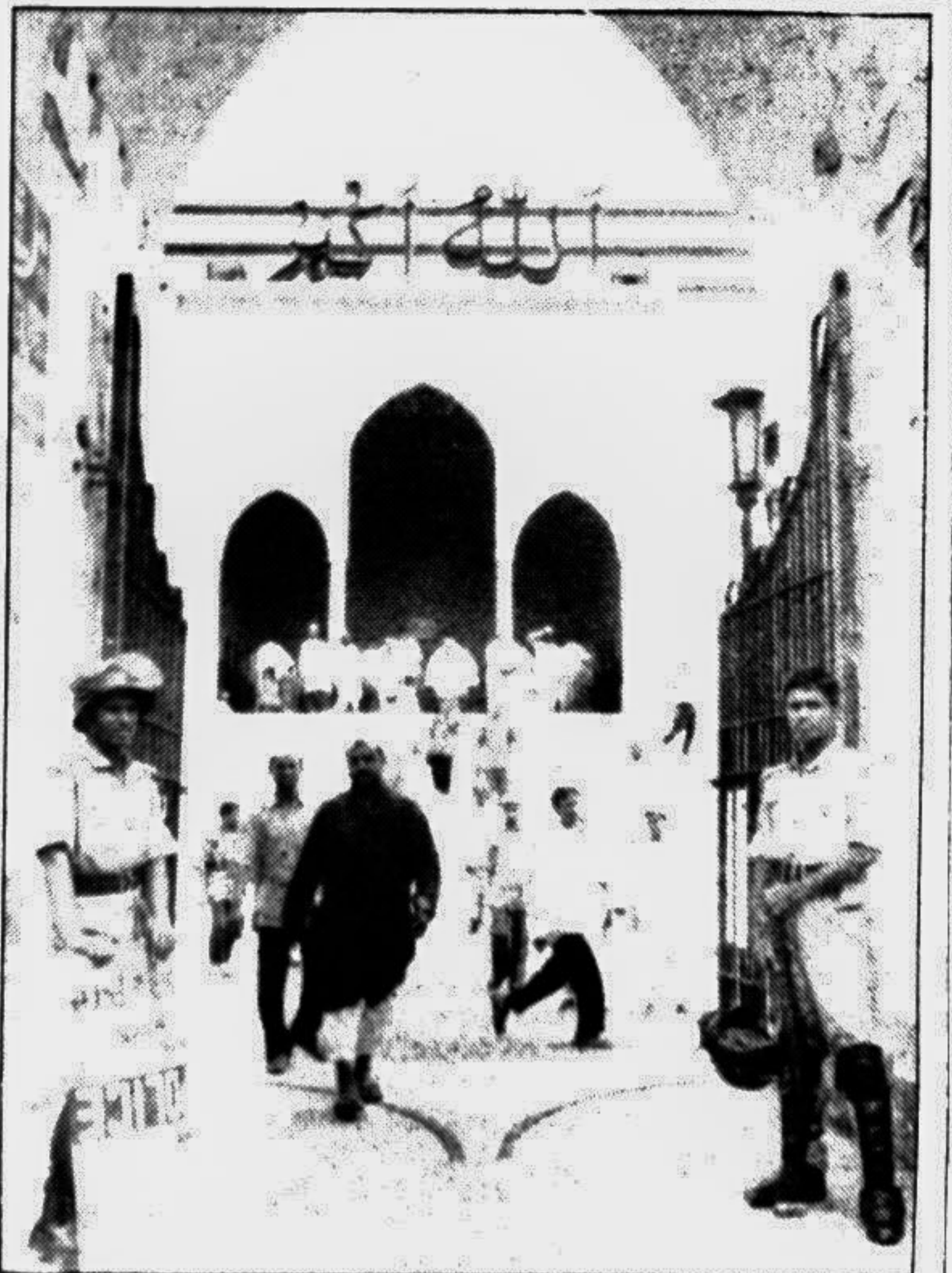
The DMP imposed Section 144 around the Baitul Mukarram mosque Friday morning and it will remain in force till further orders, police sources said. Section 144 has been imposed in the area against the backdrop of an incident Thursday evening in which an Eid-e-Miladunnabi programme of the Islamic Foundation was disrupted.

The ruling Awami League has demanded immediate arrest and stern action against those involved in creating trouble at Miladunnabi function at Baitul Mukarram mosque in presence of the President, reports UNB. "Without further delay, the anti-state elements have to be arrested and punished to prevent recurrence of such activities," said a party press release. The suggestion came from an emergency meeting of the Awami League Working Committee, held on Friday at Awami Foundation office in the city. The ruling party also called upon all pro-liberation forces.