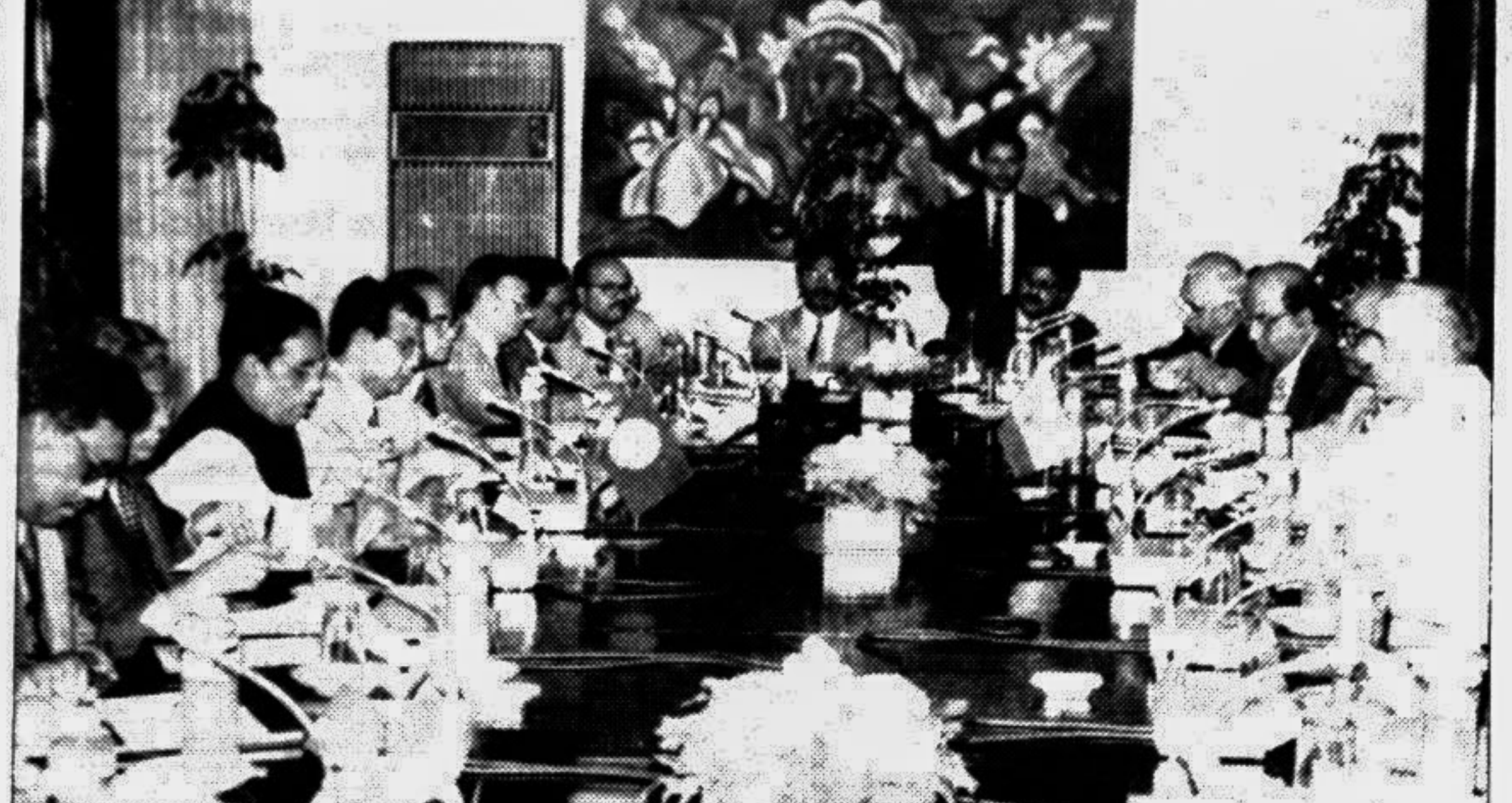
The 32nd meeting of the Indo-Bangla JRC began at the State Guest House Meghna in the city yesterday.