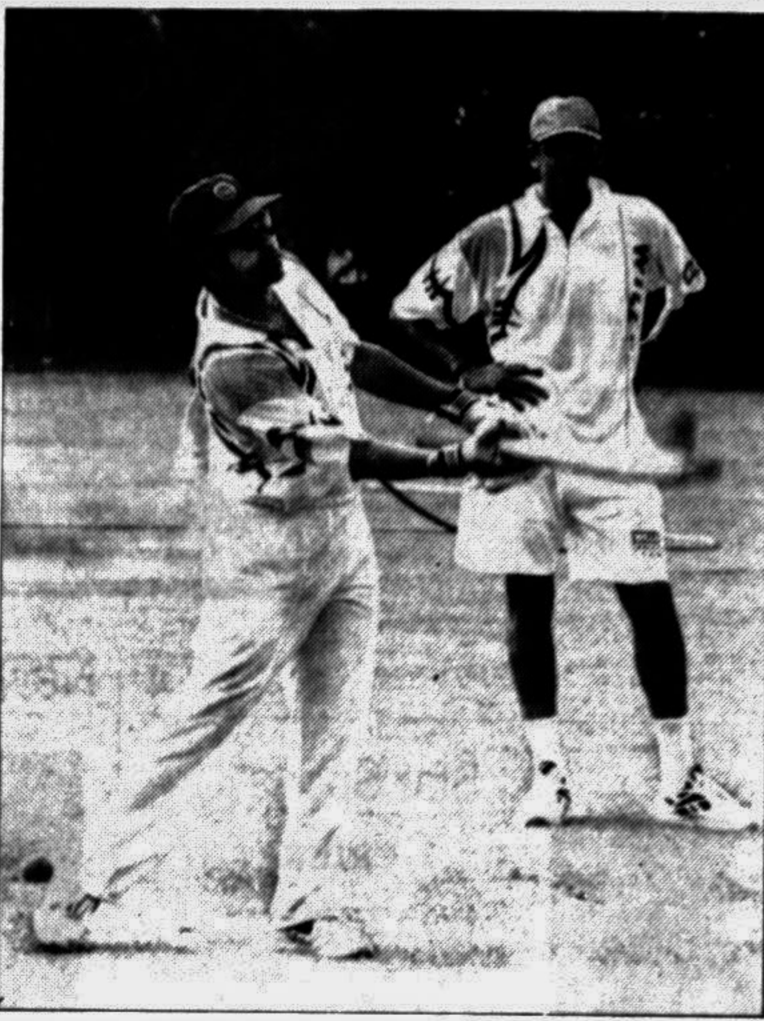
Indian skipper Sachin Tendulkar (L) leads his team in a practice session day before their first Asia Cup match against Sri Lanka in Colombo today.

Sports Reporter Sharmin Textiles Mills Model High School moved into the final of the Ali Sports School kabaddi tournament defeating Nawabpur Government High School by 100-67 points in one of the two semifinals held at the Dhaka Stadium yesterday.