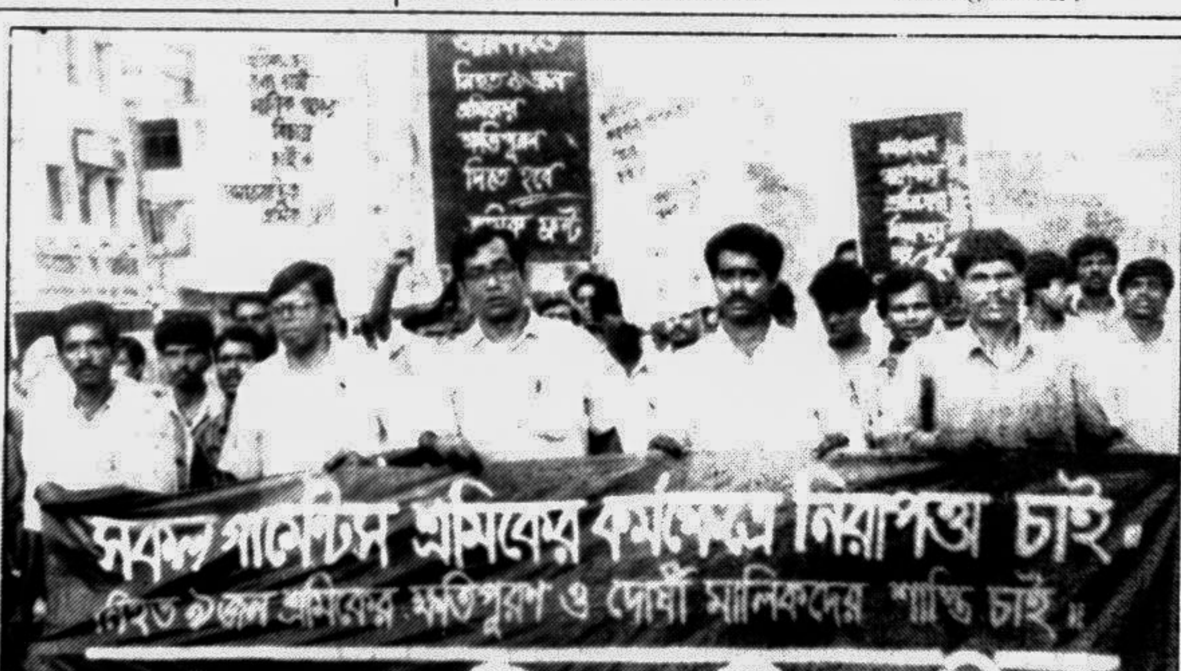
Samajtantrik Samik Front brought out a procession in the city yesterday demanding safety of garments workers in factories and compensation for nine garments' workers killed in fire in Mirpur Tuesday night.