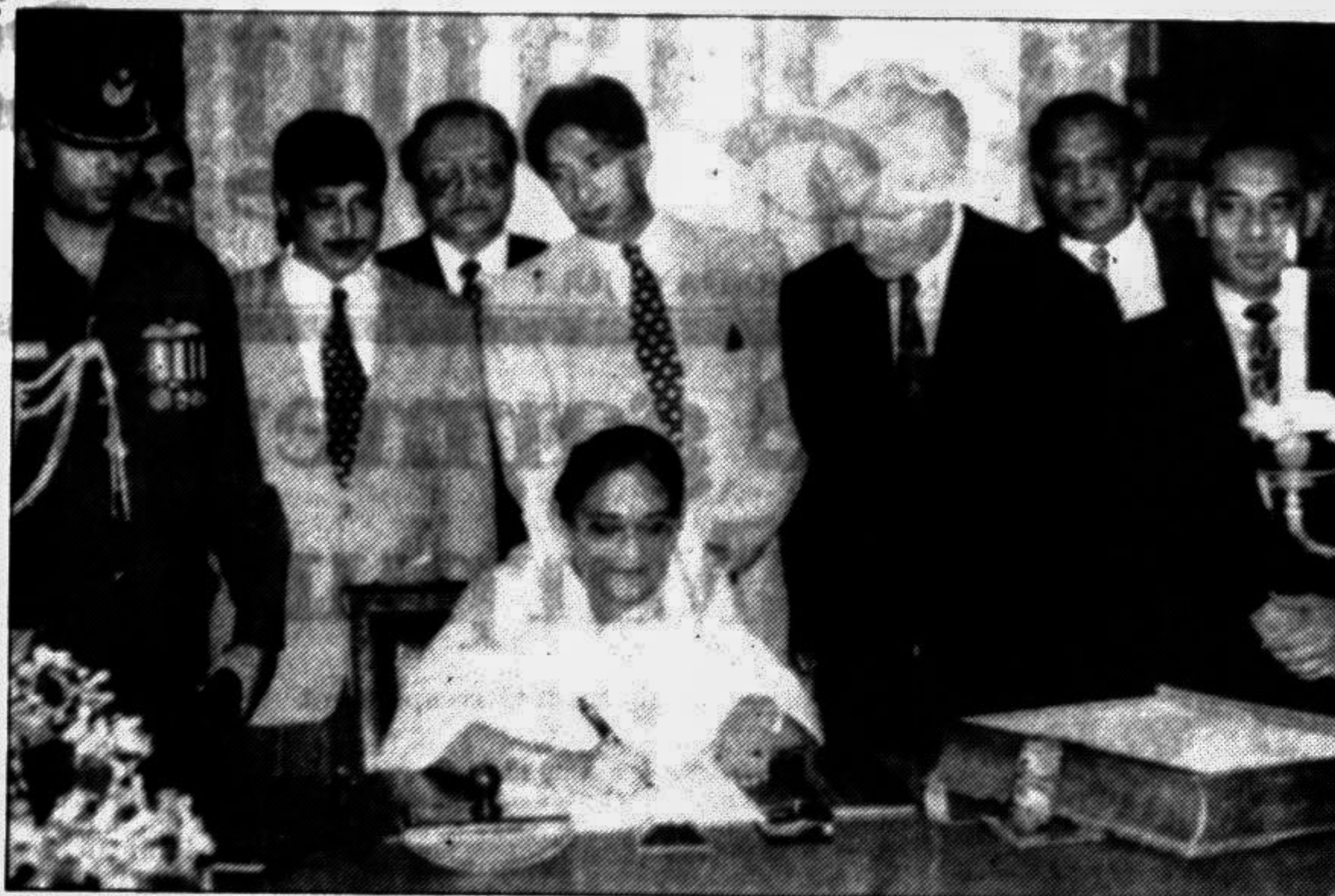
Prime Minister Sheikh Hasina signing golden book at the Hamburg City Hall Monday.

A press release yesterday night said that BTV had received the Asiavision Award for its excellent coverage of the cyclone which claimed over a hundred lives and left thousands injured or homeless.