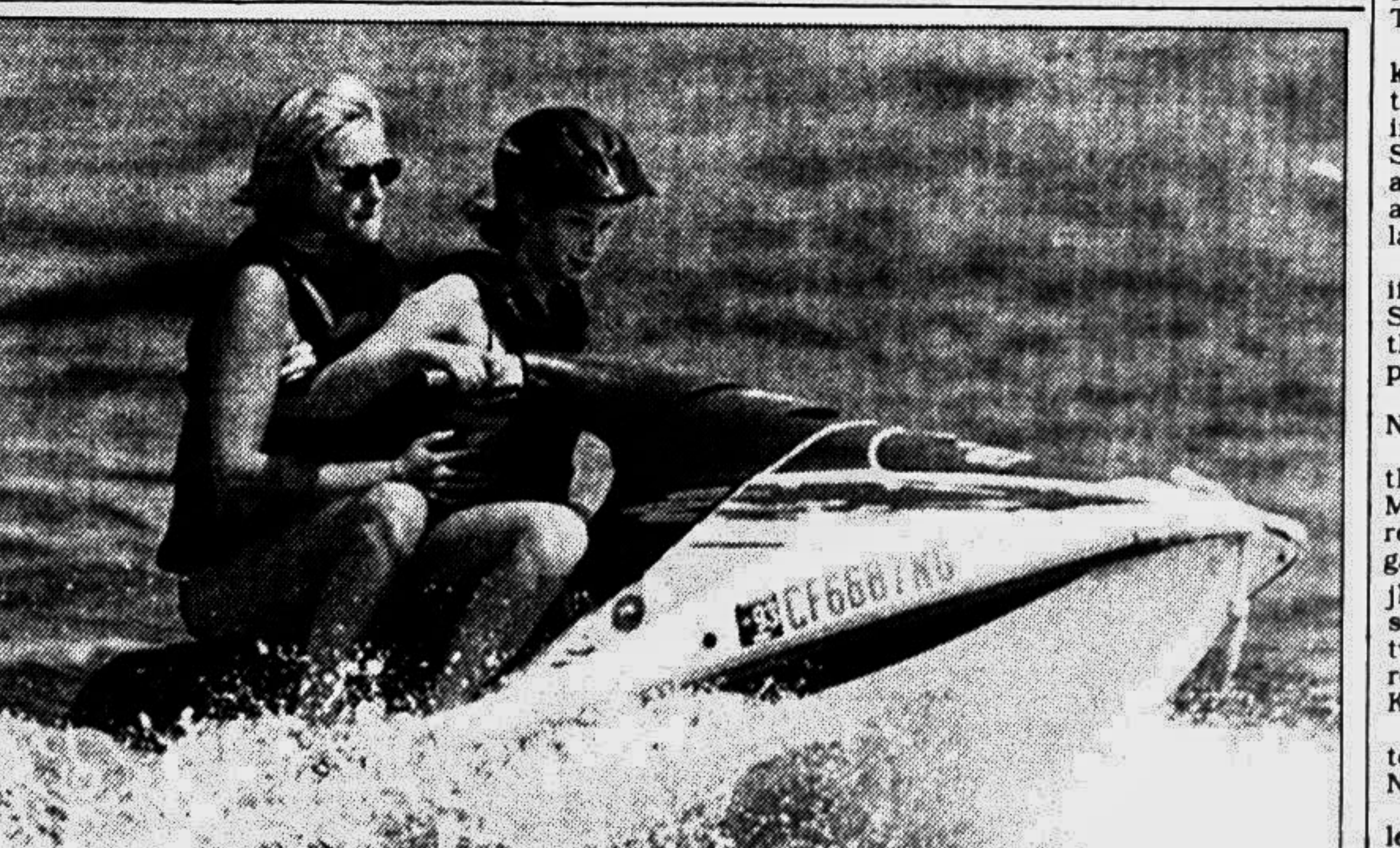
Britain's Lady Diana is taken by an unidentified young girl for a jet-ski ride in the French Riviera on July 14.