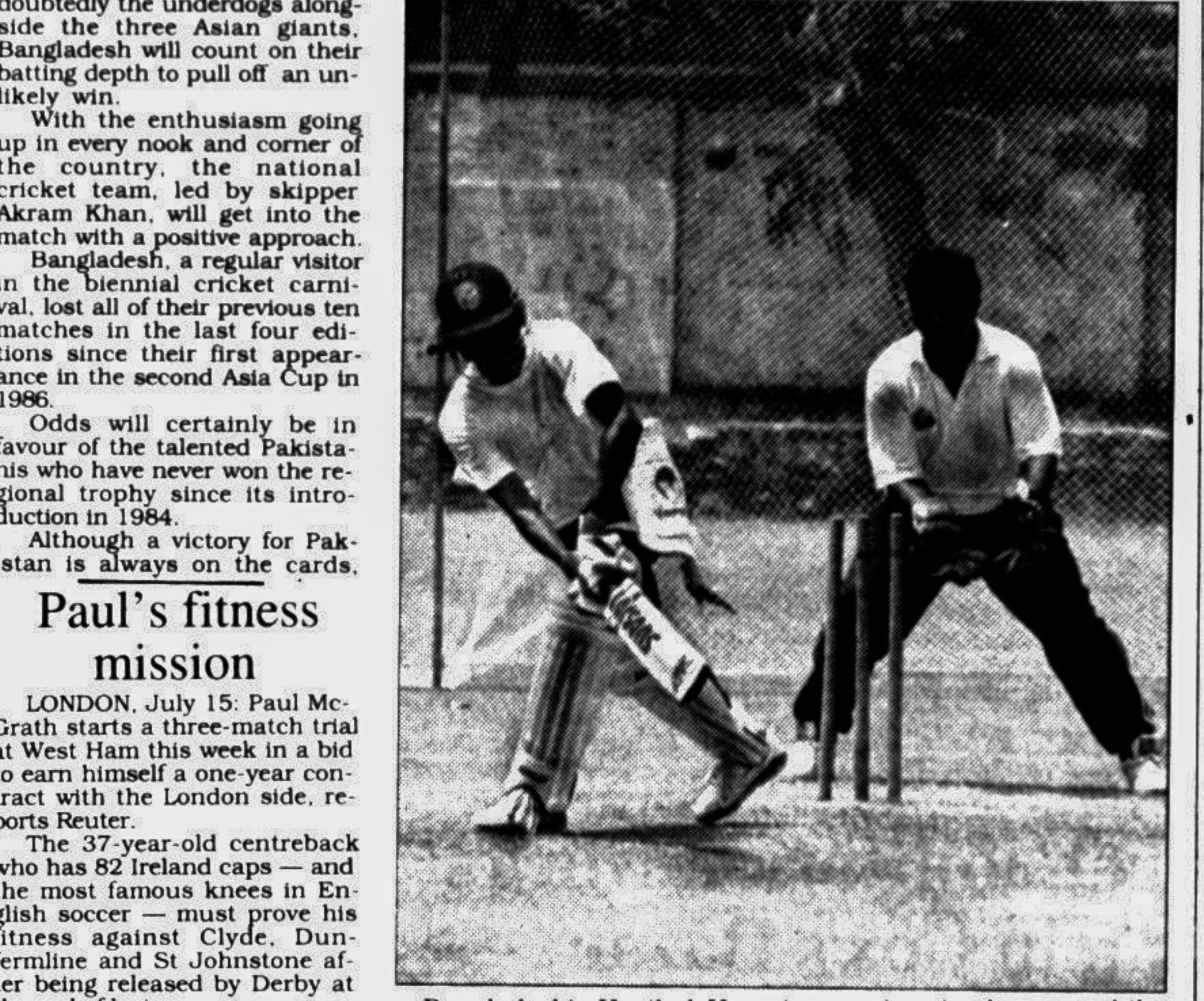
Bangladesh's Hasibul Hossain practises in the nets while manager Gazi Ashraf Hossain performs behind the stumps the day before their Asia Cup match against Pakistan in Colombo today.

TEAMS BANGLADESH: Akram Khan (capt), Aminul Islam Bulbul, Minhazul Abedin Nannu, Enamul Haq Moni, Athar Ali Khan, Khaled Masud Pilot, Habibul Bashar Sumon, Saiful Islam, Hasibul Hossain Shanta, Sheikh Salahuddin and Naimur Rahman Durjoy. PAKISTAN: Rameez Raja (capt), Saeed Anwar, Amir Sohail, Shahid Khan Afridi, Inzamamul Haq, Salim Malik, Moin Khan, Saqlain Mustaq, Aaqub Javed, Arshad Khan and Kabir Khan.