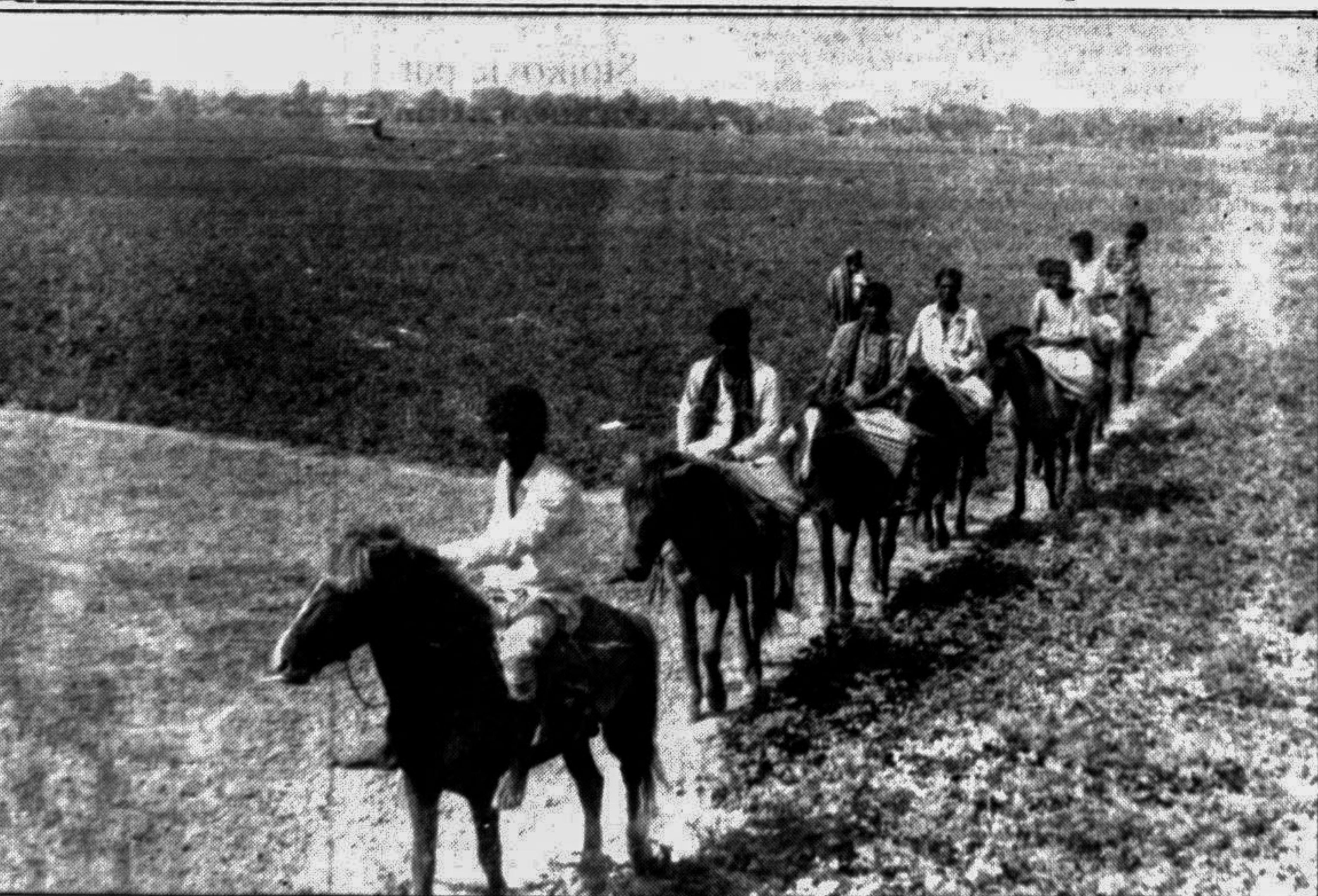
Horses are no more used in battlefield by kings. Rather the common people use the animal in their grim battle for survival. They earn their livelihood using horses now-a-days.

The Bangladesh Agriculture Development Corporation (BADC) authorities could not supply jute seeds to the growers as a result the growth of the new plants was not satisfactory. About 20 thousand hectares of land have been brought under jute cultivation programme this year. The target of production will not be achieved because of low quality seeds and want of rainfall.