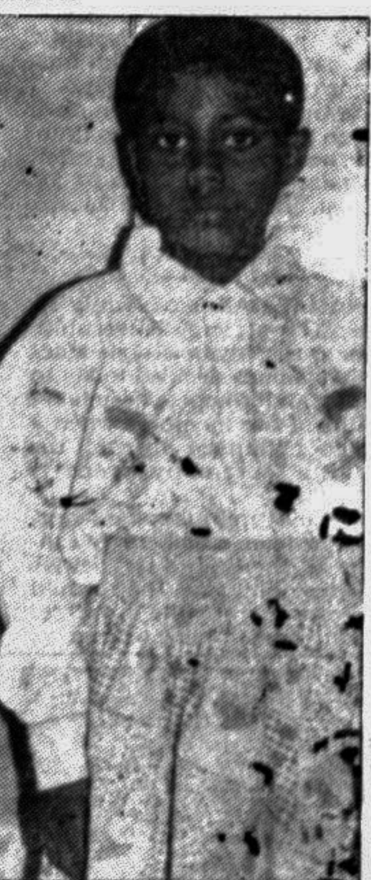
JESSORE: Juthi was rescued from the clutch of child-lifters in the district town by local people recently.