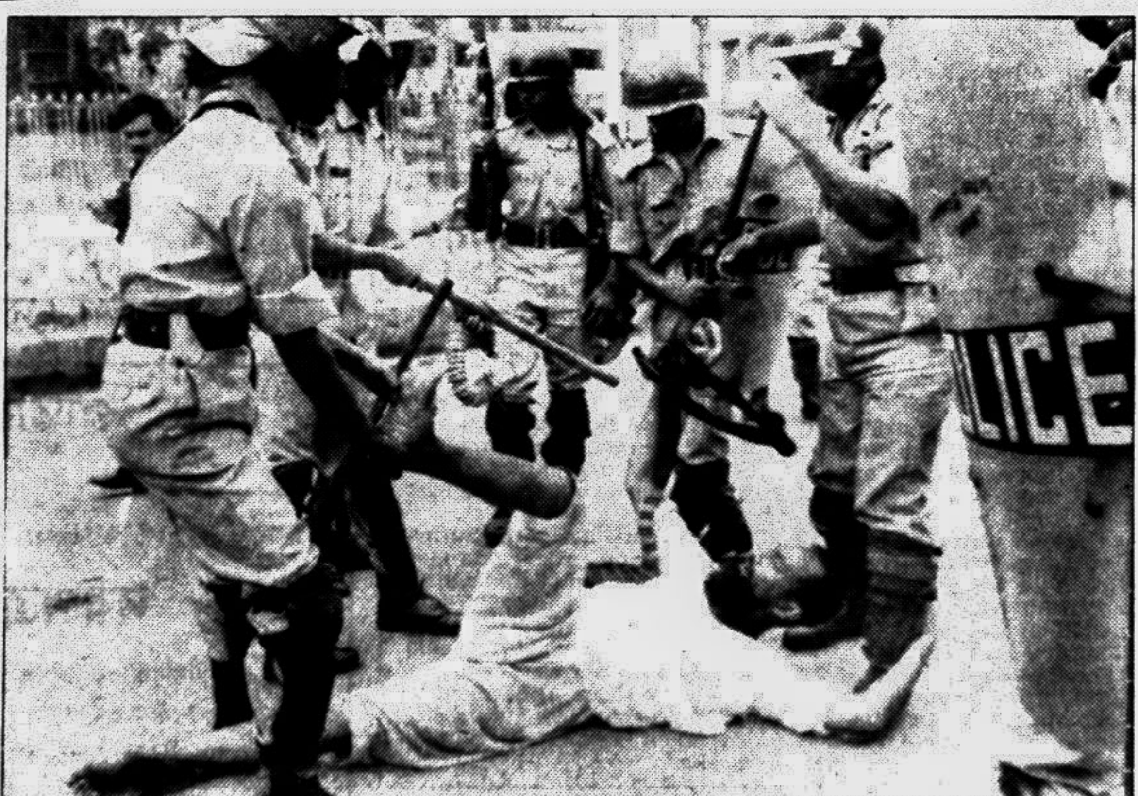
IJO activists clashed with police at Purana Paltan in the city during hartal hours yesterday.

lowing flash flood in 96 thanas of the country's 21 districts which affected nearly 30 lakh people, an official handout said yesterday. The handout said some 30 lakh people belonging to four lakh families were affected in the flash flood. Another handout said supply and distribution of relief materials in 21 flood affected districts could not be carried out due to halt. It said the vehicles carrying relief goods could not move from district and thana head- See Page 12 Col 8