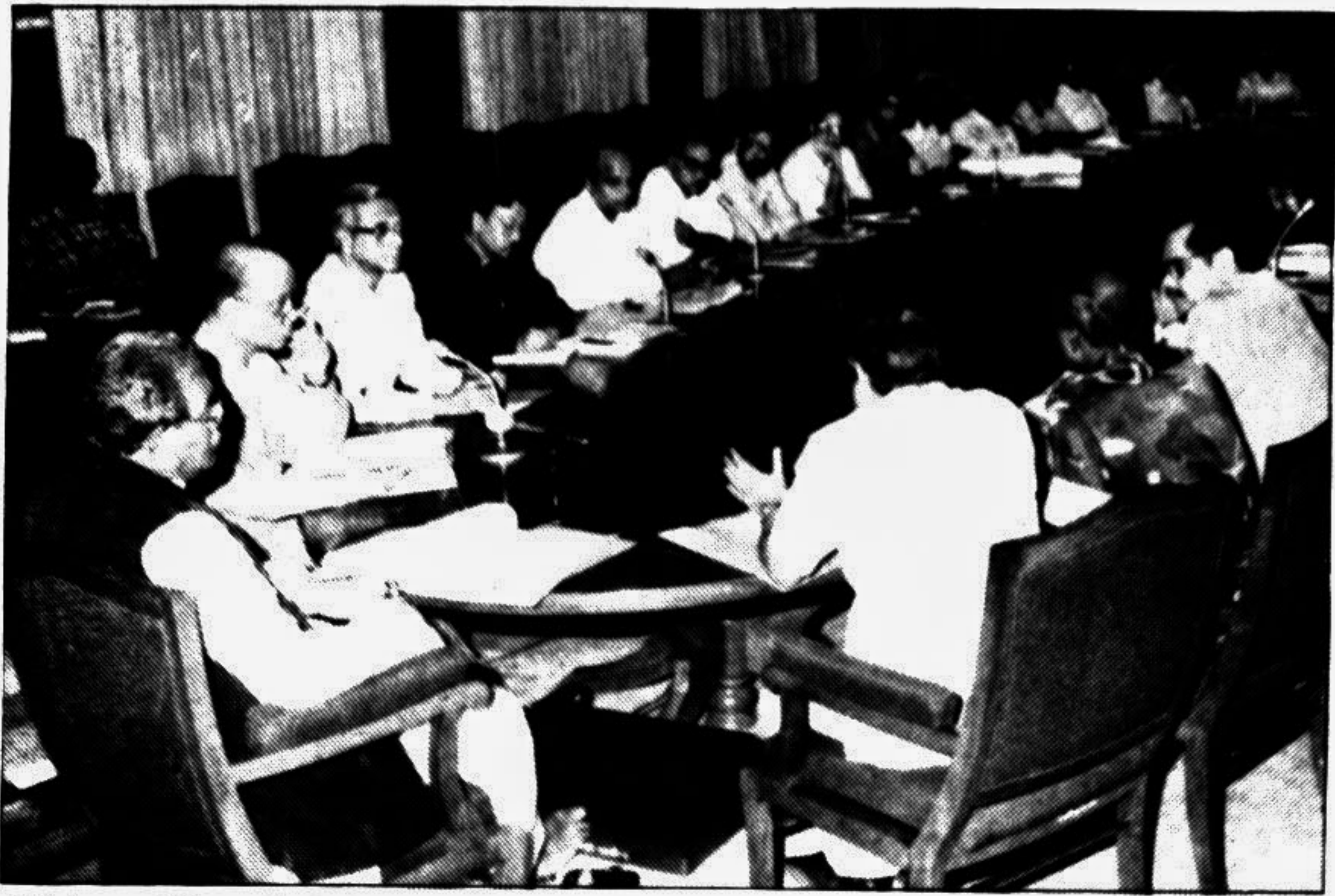
Minister of State for Relief and Disaster Management Talukder Abdul Khaleq is presiding over an inter-ministerial meeting of the Disaster Management Committee at the Cabinet room of the Secretariate yesterday.