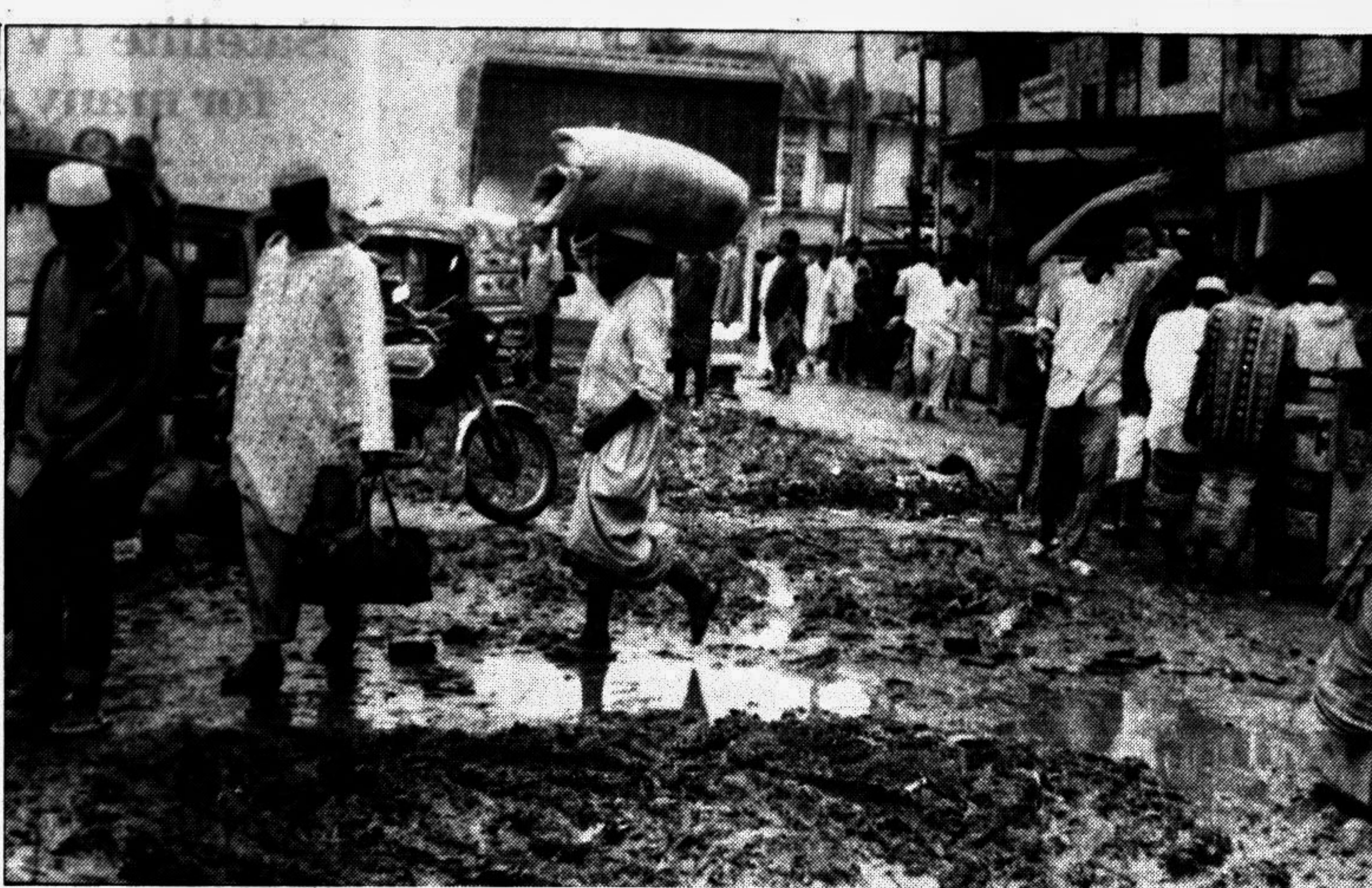
Pedestrians negotiating a water-logged road near Gabtoli Bus Terminal in the city yesterday.

Azad hoped that the fraternal relations between the two countries would be further strengthened in the days ahead.