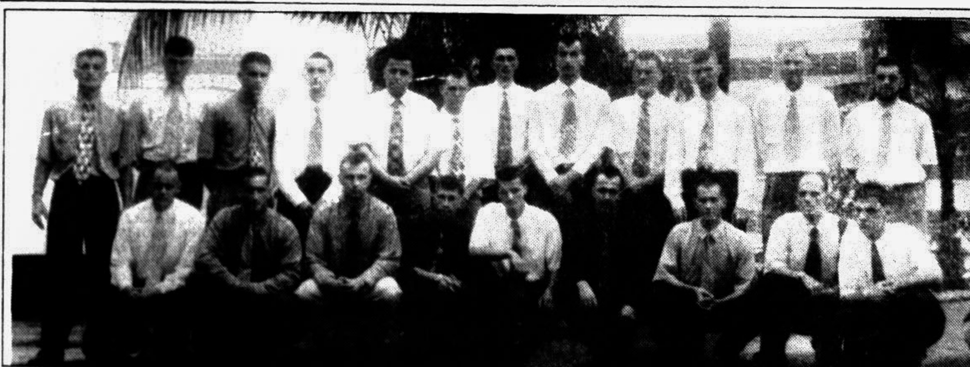
Bosnian cadets joined Bangladesh Military Academy (BMA) for a training course yesterday.