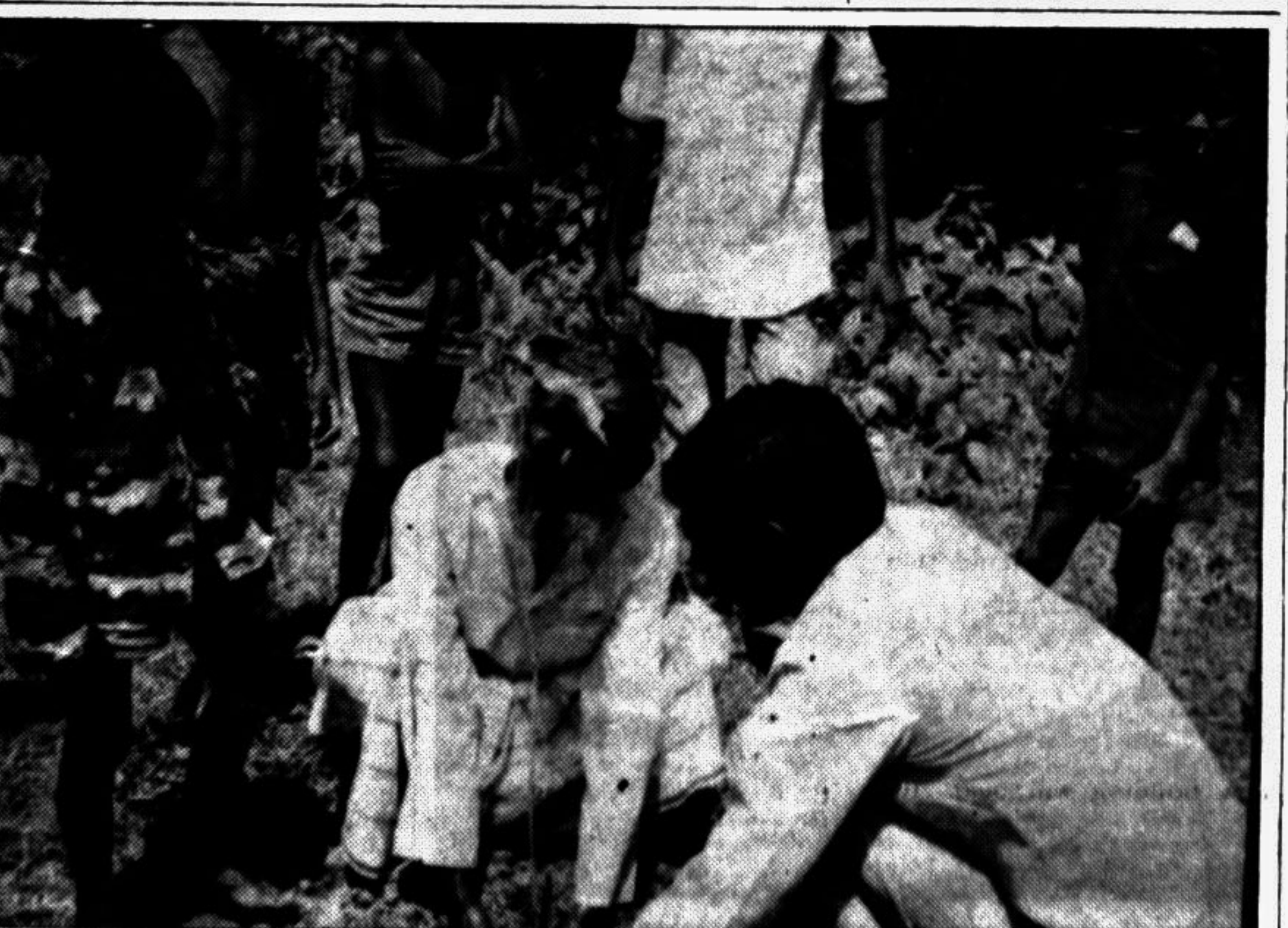
KUSHITIA: The afforestation campaign was inaugurated in the district town by planting a sapling in the premises of a primary school at village Dahakula under the sadar thana recently.