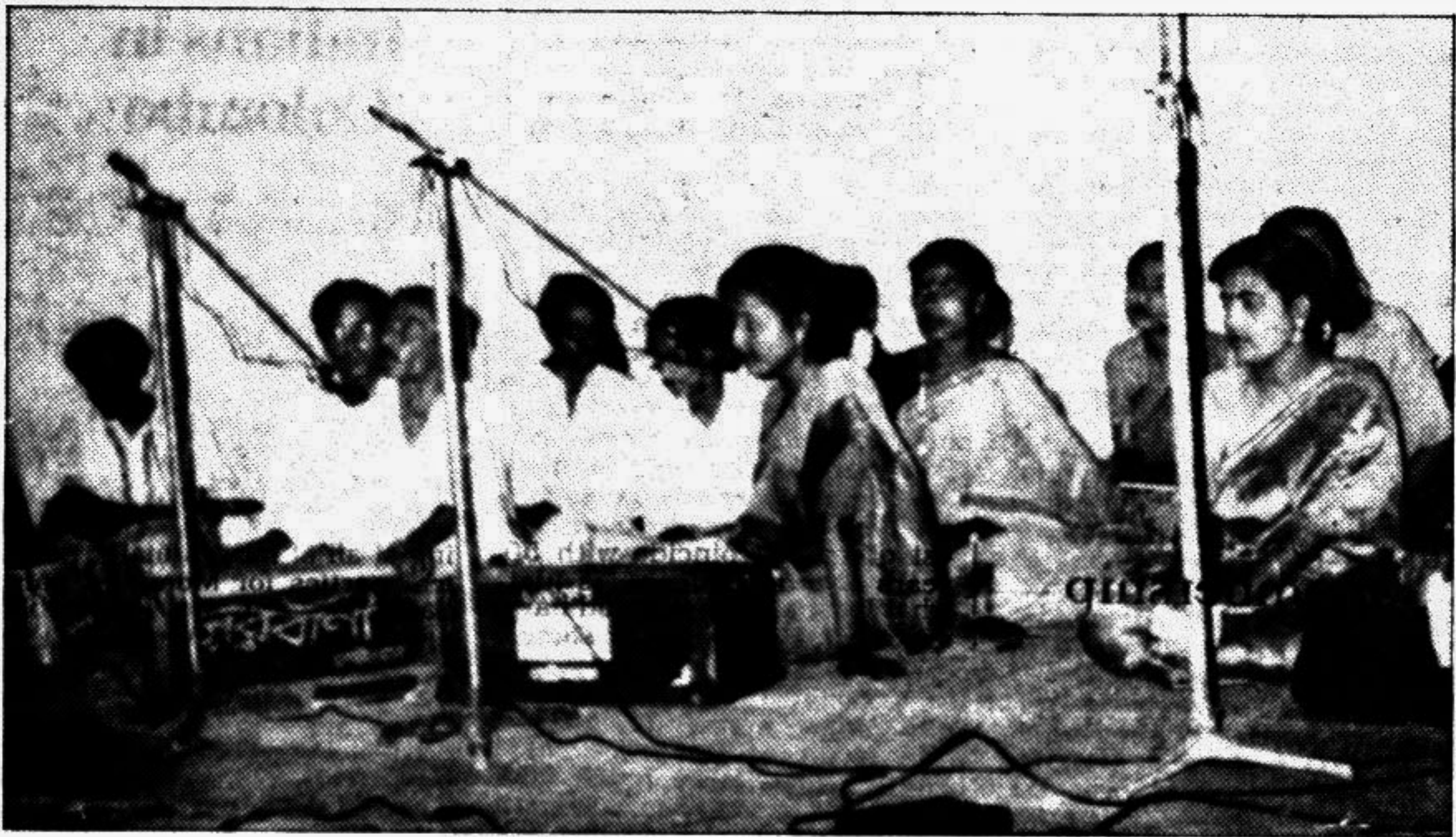
GAIBANDHA: The artistes of Surobani Sangsad, a local cultural organisation, rendering songs at a musical soiree held here recently.