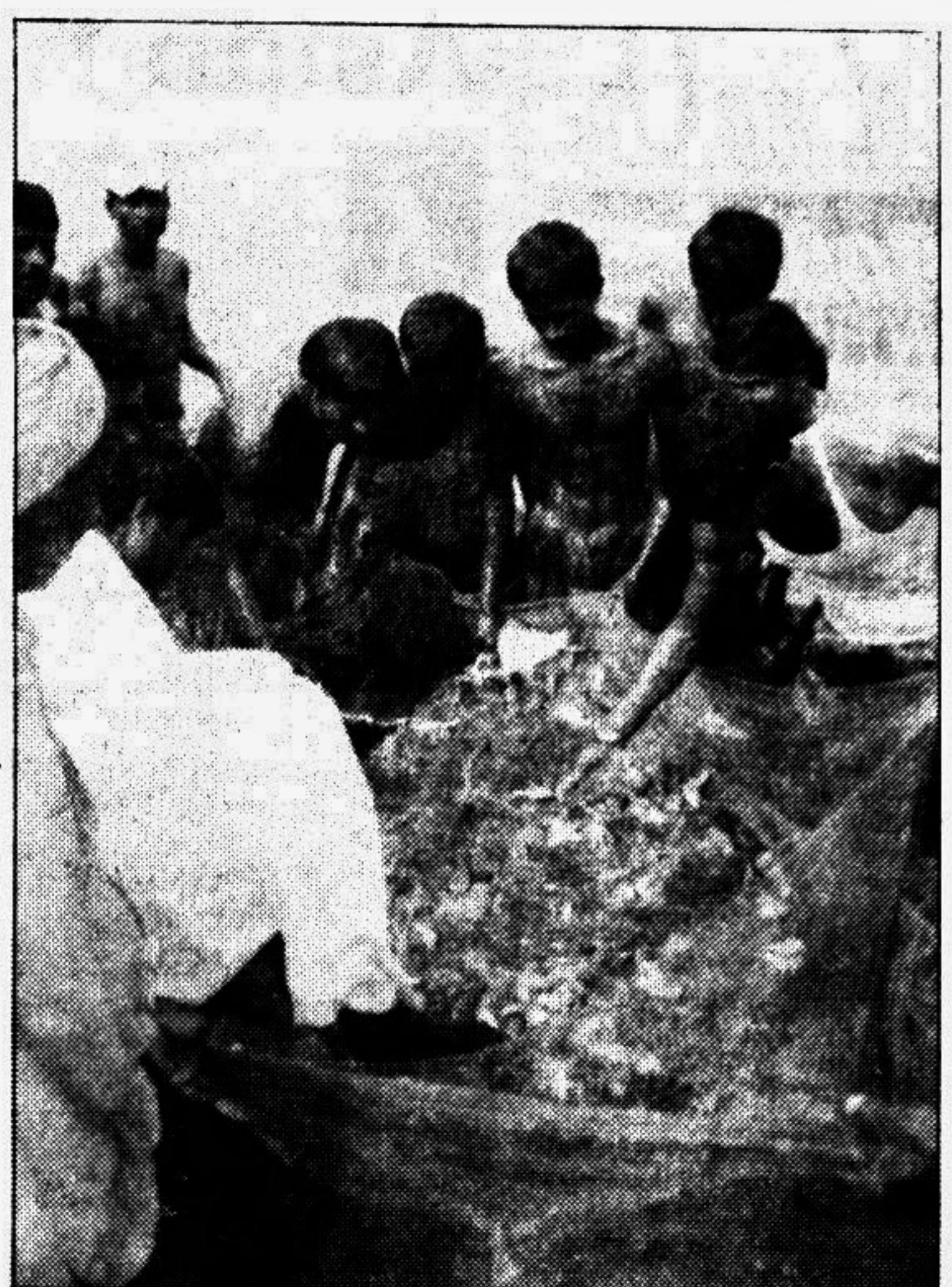
MAGURA: Fish fries are being sold in rural markets of the district defying government ban on it. Using current net some youths fishing fries before the nose of members of law enforcing agencies near the town recently.