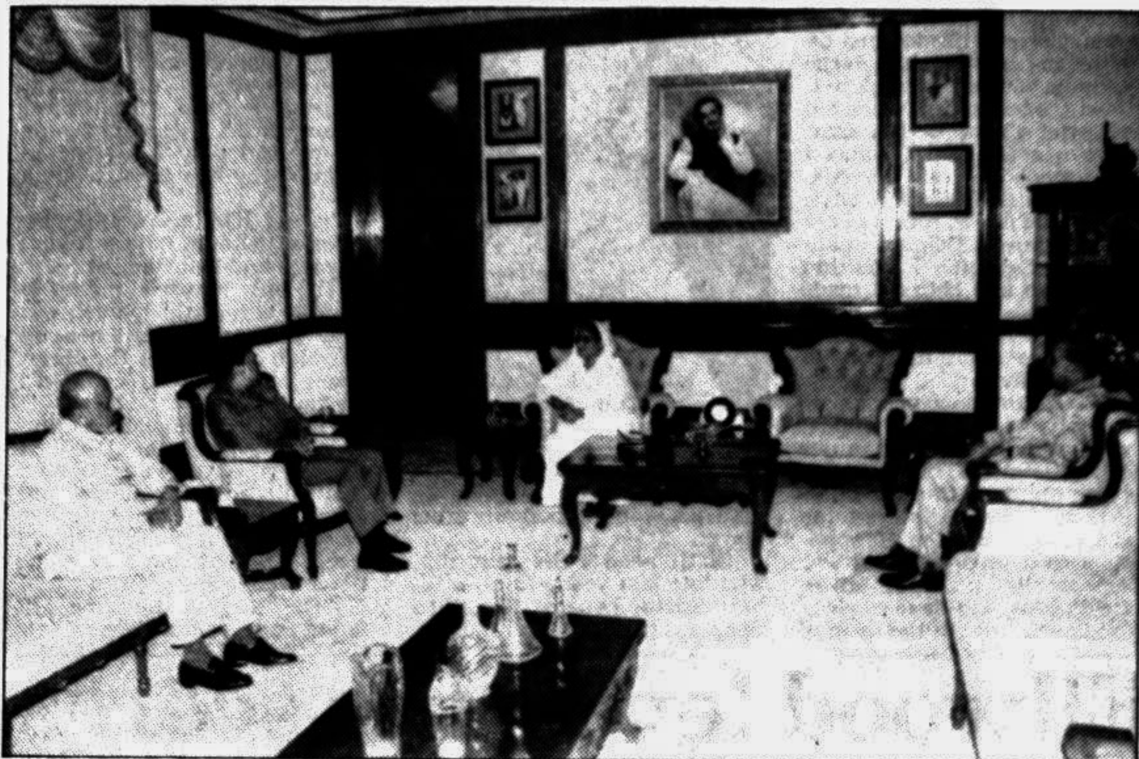
Chiefs of the three services called on Prime Minister Sheikh Hasina at Ganabhaban yesterday.

PLEASE CONTACT: BANGLADESH AIR EXPRESS INT'L For more information call-Head Office: 966514, Gulshan: 607657, 887771, Chittagong: (031) 712127, Khulna: (041) 725008