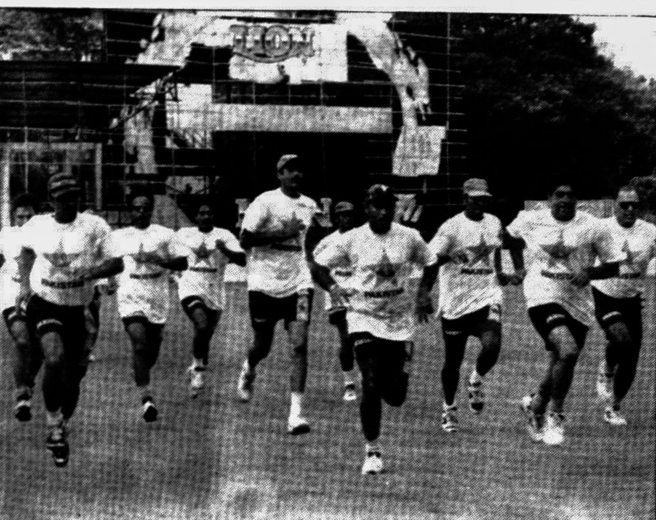
The Pakistan squad jogs at the Sinhalese Sports Club ground yesterday in preparation for the four-nation Asia Cup cricket tournament opening on July 14.