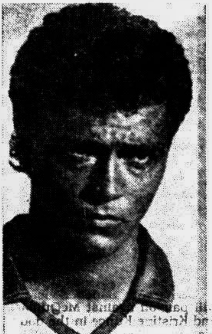
Romario (Brazilian star striker) 'You will see, Ronaldo and me will finish on top of the scoring tables in 1998.'