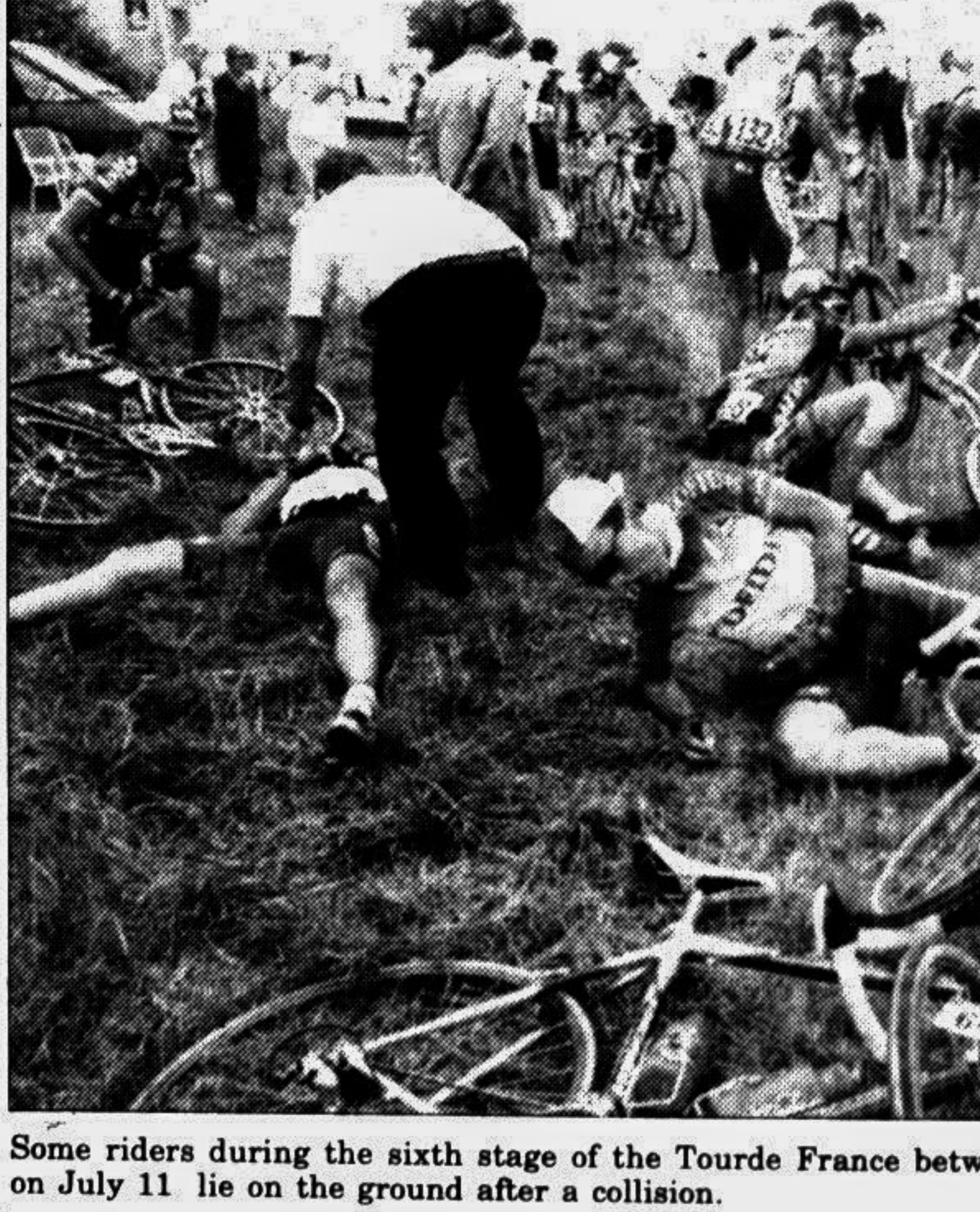
Some riders during the sixth stage of the Tourde France between Le Blanc and Marennes on July 11 lie on the ground after a collision.