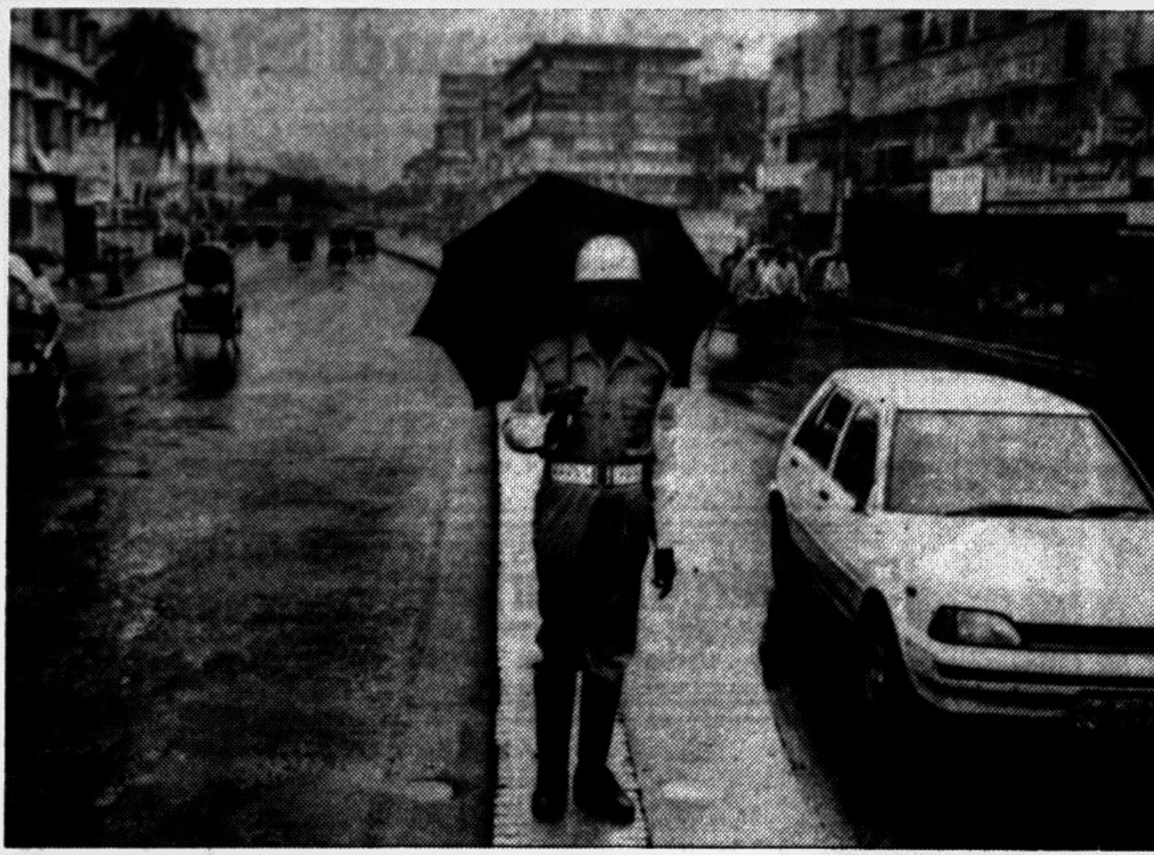
An idle traffic police guarding the city's DIT extension road yesterday afternoon. Three days of monsoon rains have interrupted normal city life. The dank weekend affected the income of rickshaw-pullers, vendors and beggars as citizens preferred to stay at home. Meteorologists forecast more rains today.