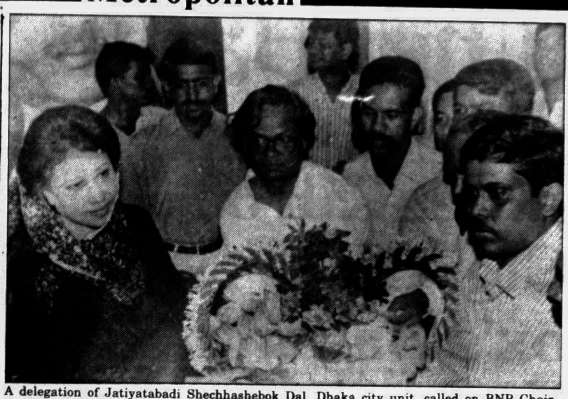
A delegation of Jatiyatabadi Shechhashebok Dal, Dhaka city unit, called on BNP Chairperson Khaleda Zia at her Minto Road residence yesterday.