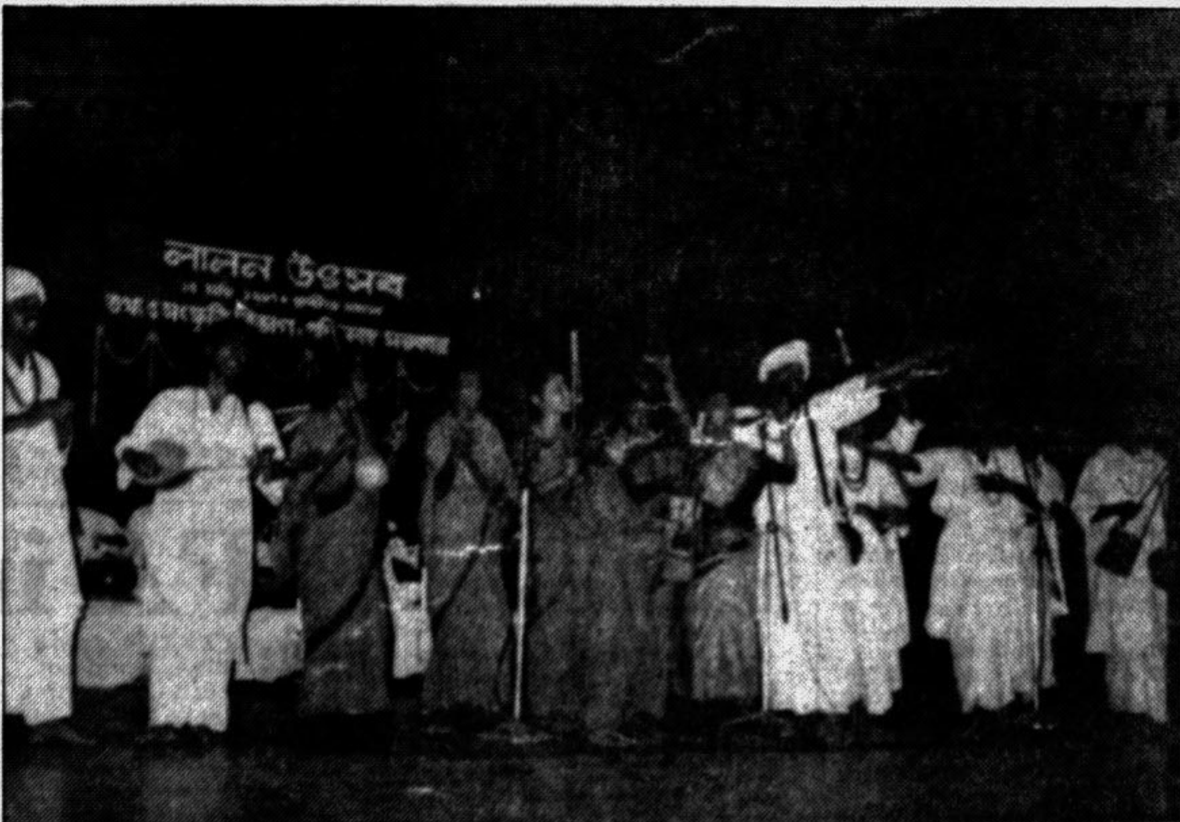
KUSHIA: Artists of local Lalon Academy and local Shilpakala Academy enthralled the audience of Calcutta and Nadia districts in West Bengal recently. They performed there at the invitation of West Bengal Government.

Their demands include withdrawal of the government decision to privatise the public sector industries and declaration of a national minimum wage.