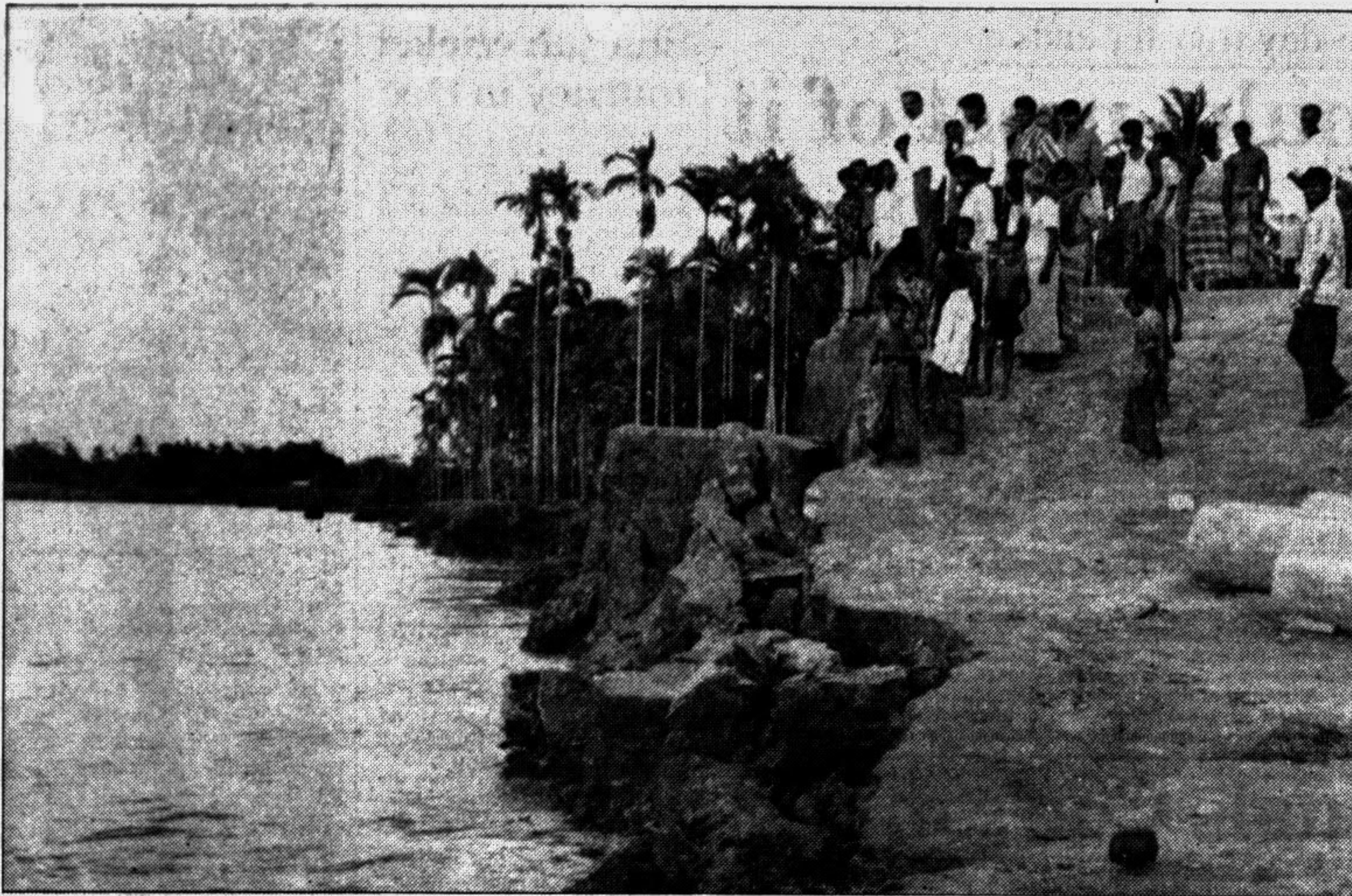
CHANDPUR: The river Meghna has devoured a large area of Haimchar thana in the district recently.