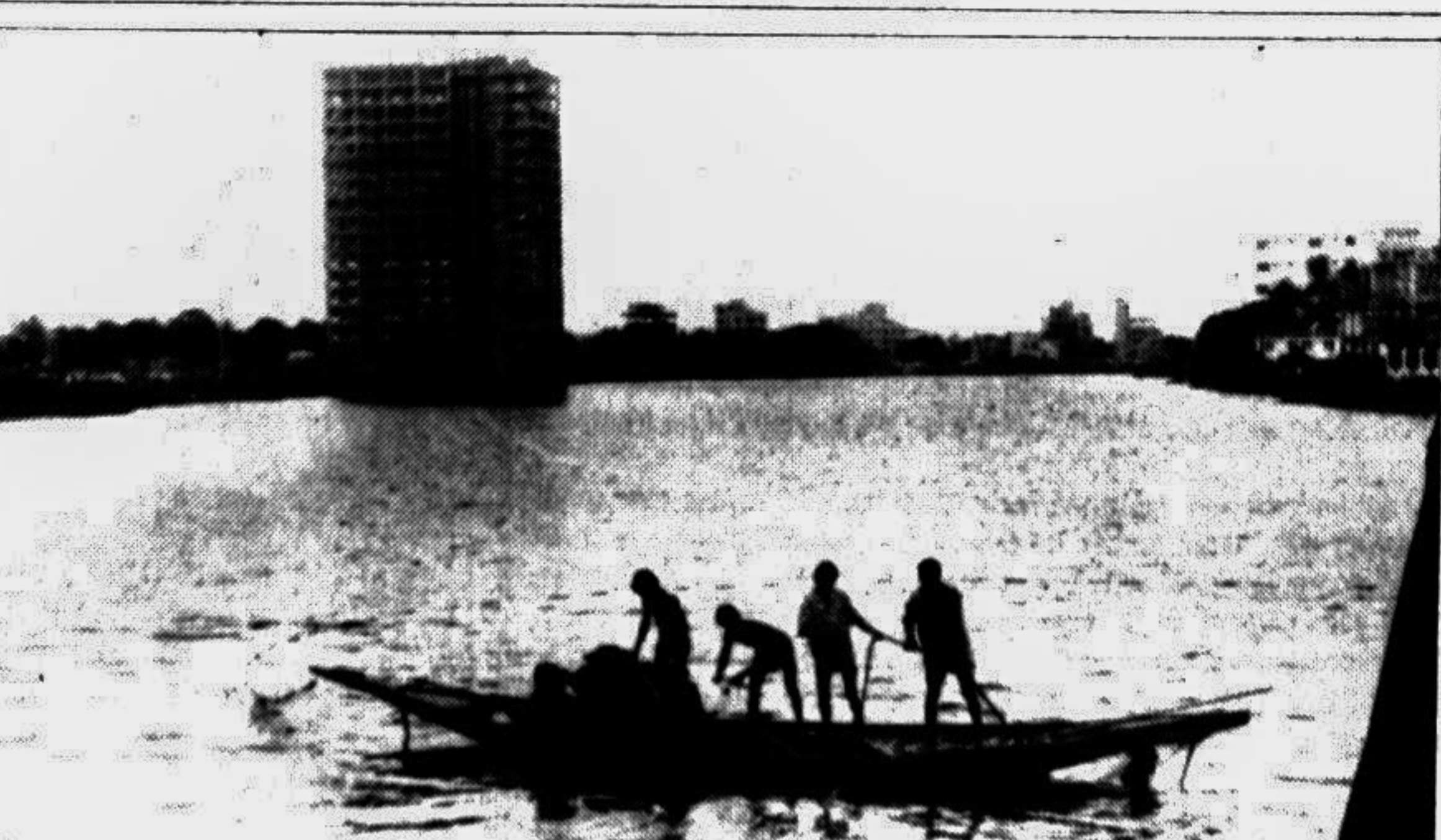
The Gulshan Lake is set for handover to private property developers.

Meanwhile, port officials said work resumed in full swing at the port's jetties, sheds and anchored vessels.