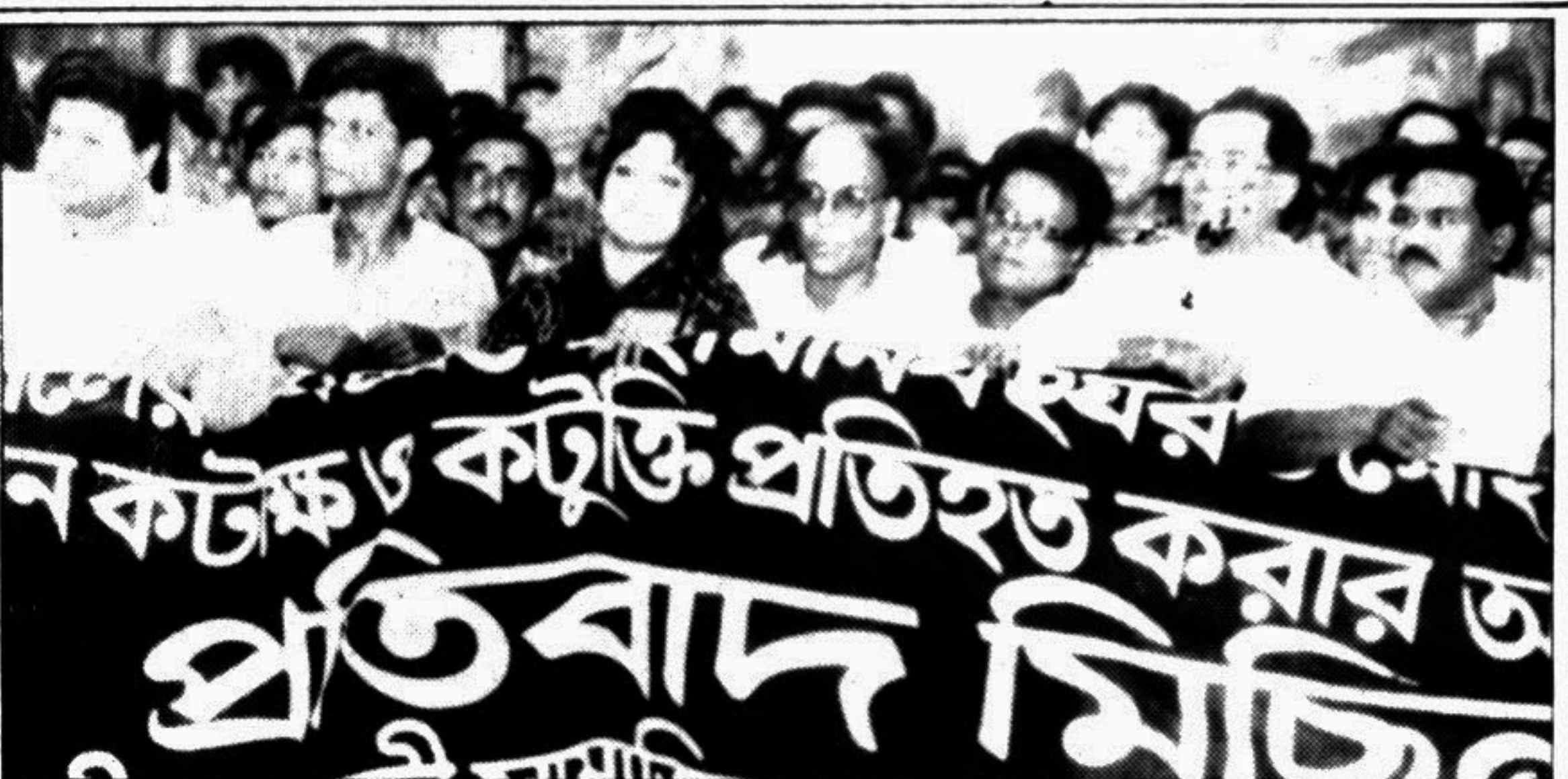
Jatiyatabadi Samajik Sangskritik Sangstha (JASAS) brought out a procession in the city yesterday protesting the anti-Islam posters released in Israel recently.

The country's highest temperature 34.4 degrees Celsius was recorded at Jessore and the lowest 21.5 degrees at Rangamati.