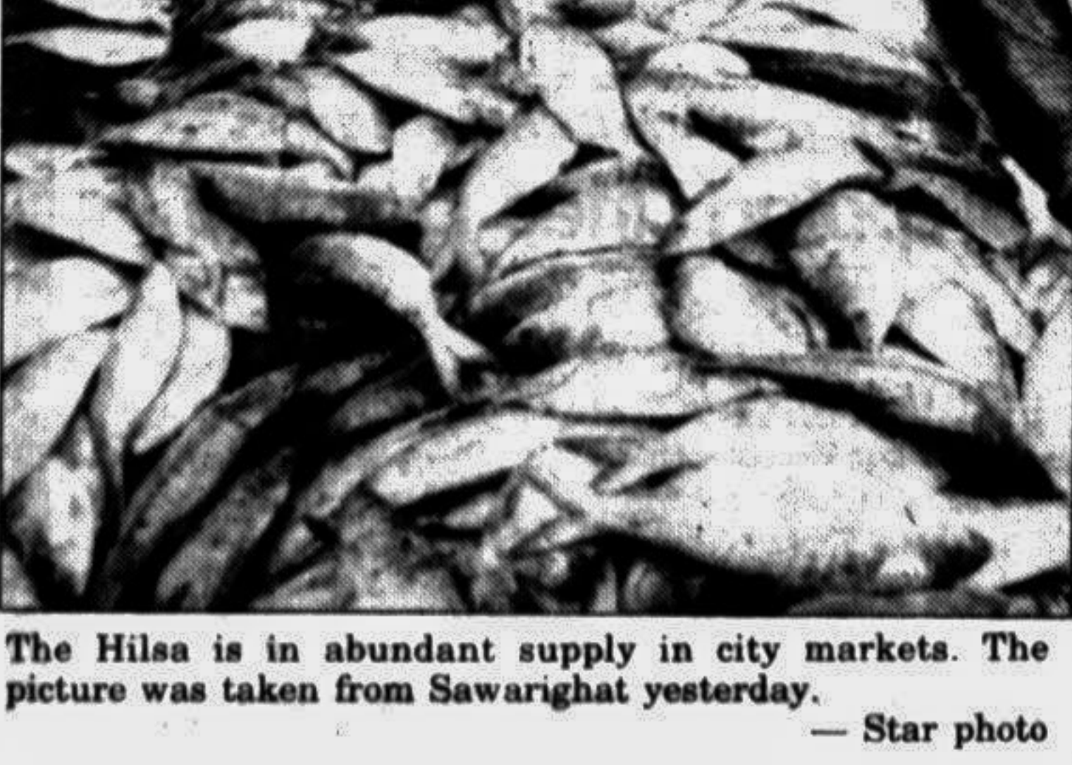
The Hilsa is in abundant supply in city markets. The picture was taken from Sawarighat yesterday.

PABNA, July 6: Twenty villages in Chatmohar thana were flooded due to onrush of water from three tributaries of the river Jamuna today, reports UNB. According to officials, standing crops on about 5,000 acres of land were submerged in last 24 hours till 6 pm today. The water level in the Gumani river rose by 22 cm, Chiknai 14 cm and Boral by 17 cm during the period, leaving some 1000 people of Haripur, Saikula, Nimachhara and Polizana unions marooned. See Page 12 Col 5