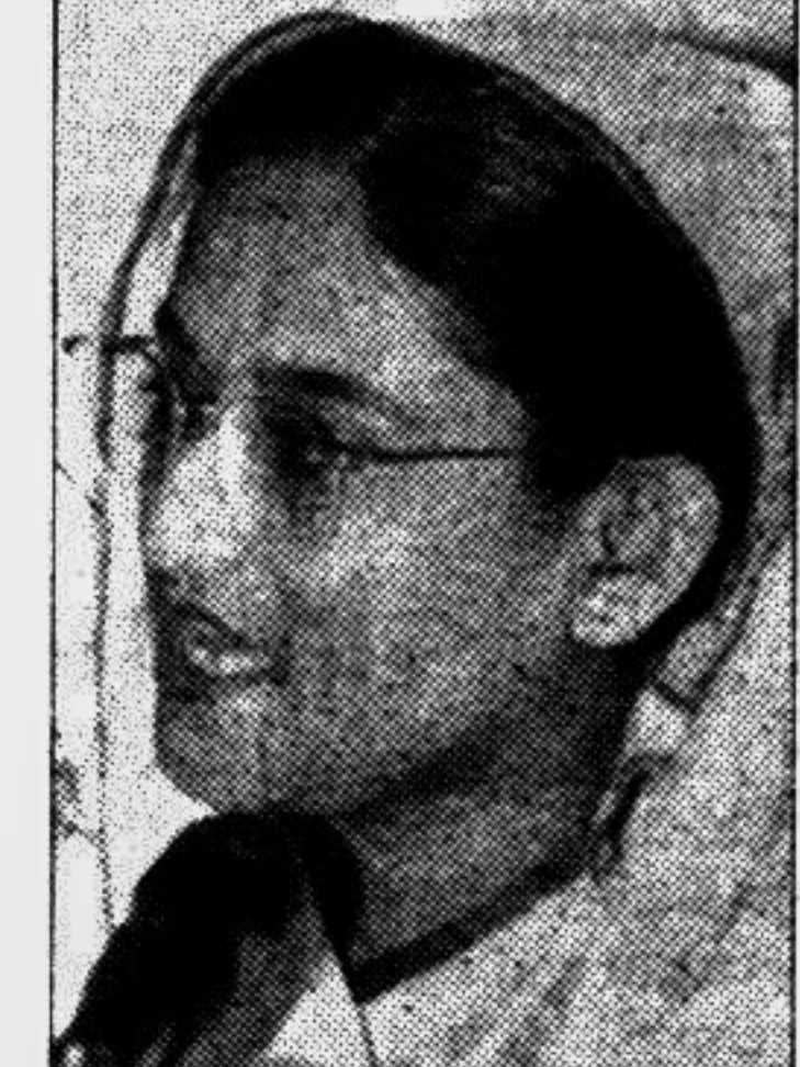
Prime Minister Hasina