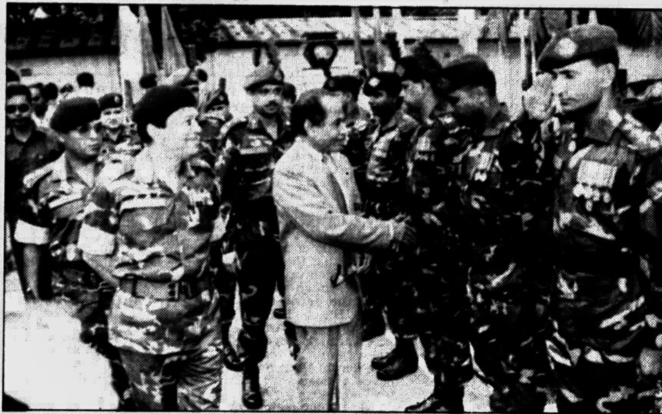
President Justice Shahabuddin Ahmed on his arrival at the 22nd Raising Day function of the President's Guard Regiment at Dhaka Cantonment yesterday.