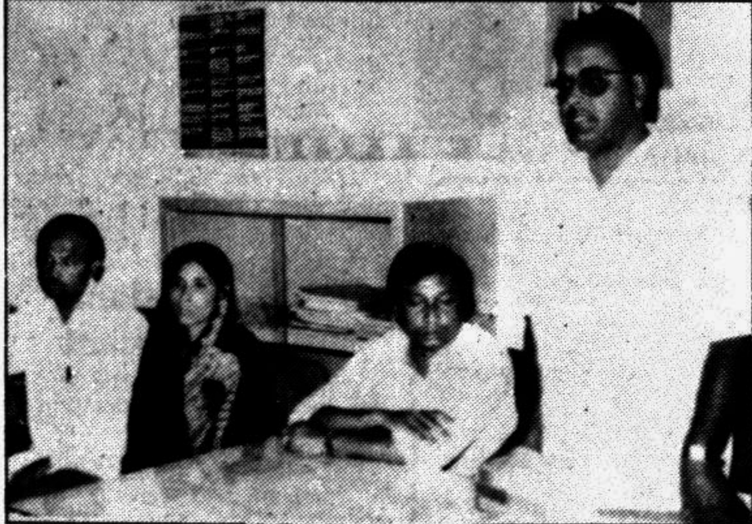
BARISAL: A workshop on 'Sanitation Orientation for Workers' was held at the Community Service Centre office here recently.

MAGURA, July 4: Two alleged dacoits were caught red handed with arms and ammunition in village Raynagar of Sripur thana in the district on June 27 by the police. According to the police, acting on a secret information Sripur thana police led by Nazmul Islam Officer-in-Charge (OC) arrested Akkas Ali, 30, and Sukman Ali, 35, with three pipe guns, two shutter guns and nine rounds of bullets in a special drive when they were attempting to commit a dacoity. A case was lodged with the respective thana.