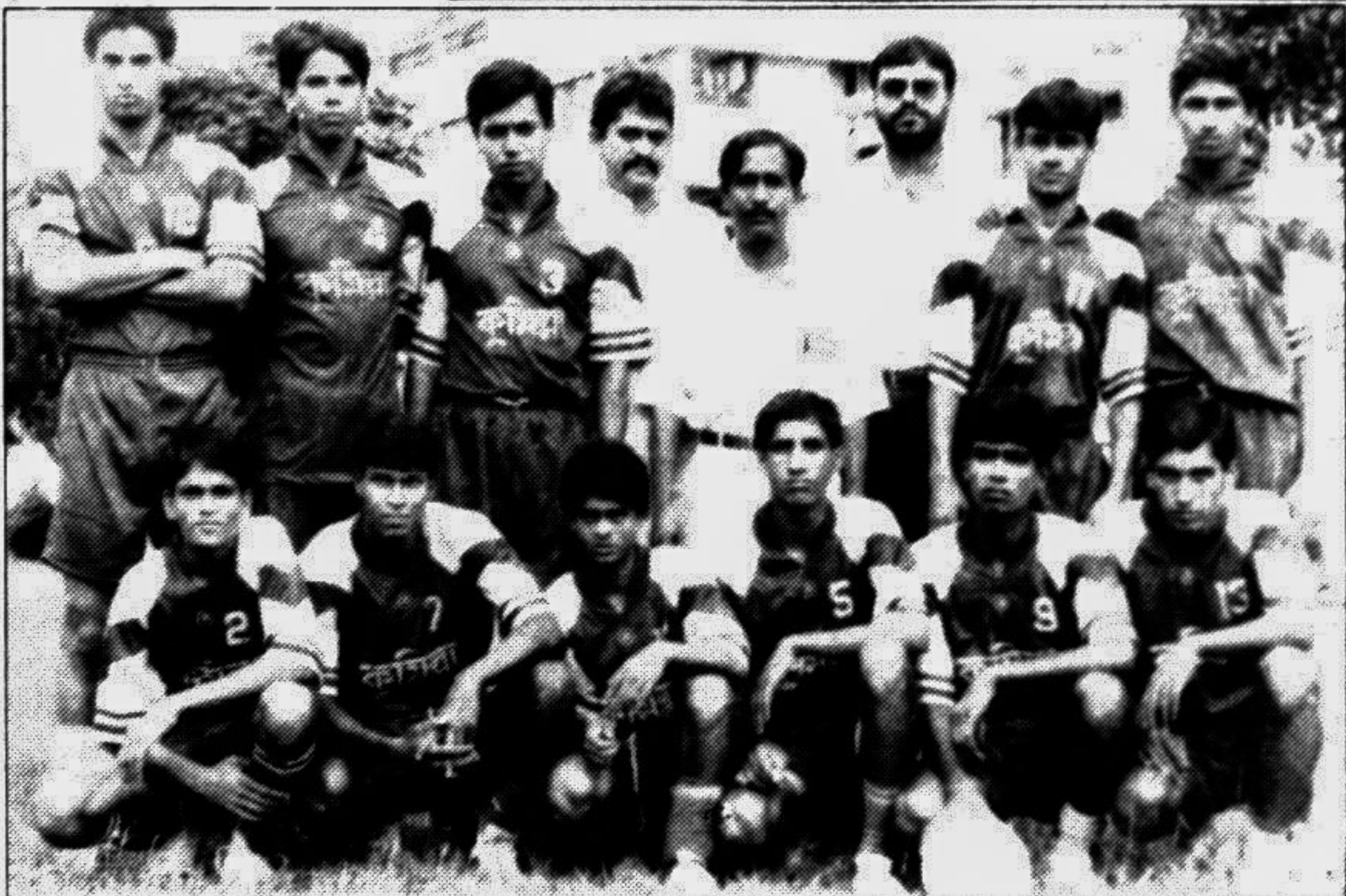
Players and officials of the Comilla team, which lifted the Multidrive 16th national youth volleyball title, pose after defeating Gazipur in the final yesterday.