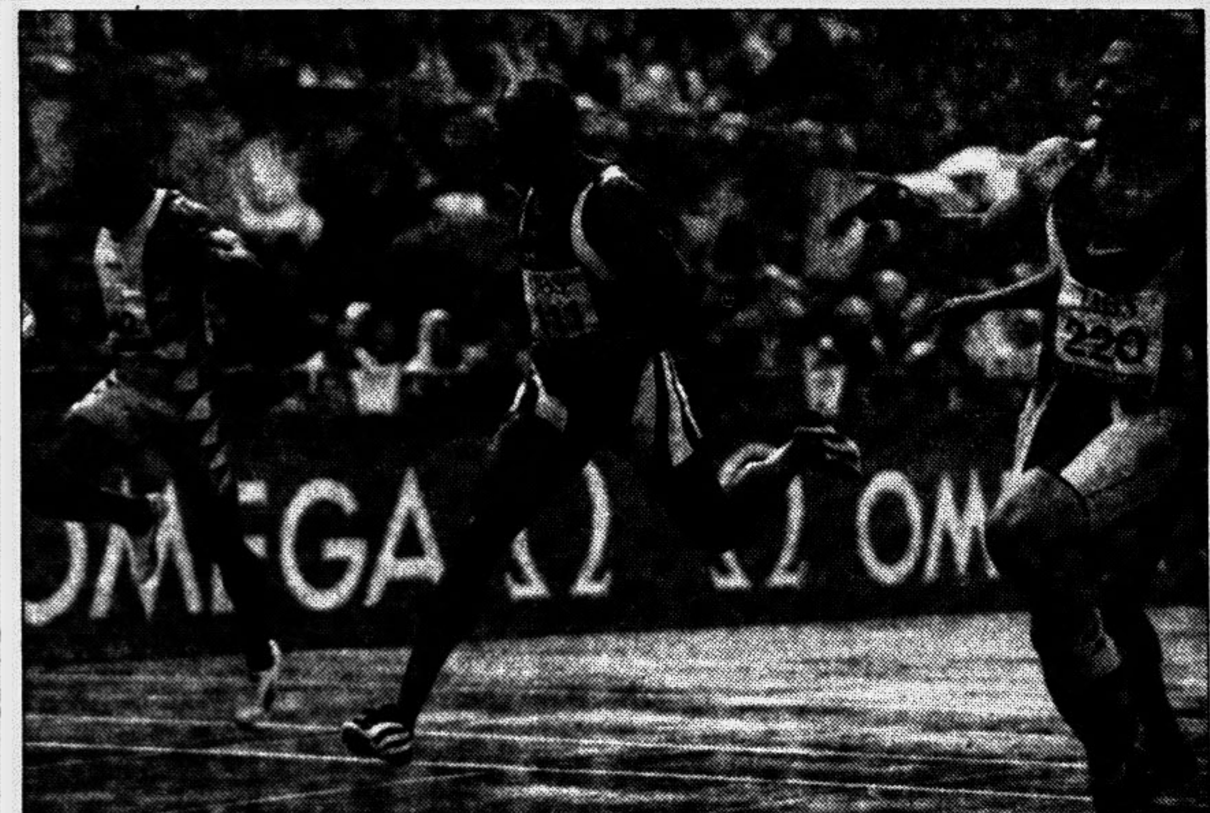
Maurice Greene (R), who became the third fastest American of all time by clocking 9.90 seconds in the 100 metres dash at the IAAF Grand Prix in Lausanne, Switzerland on July 2, crosses the finish-line during the event.

(The writer is a contributor to the Star Sport)