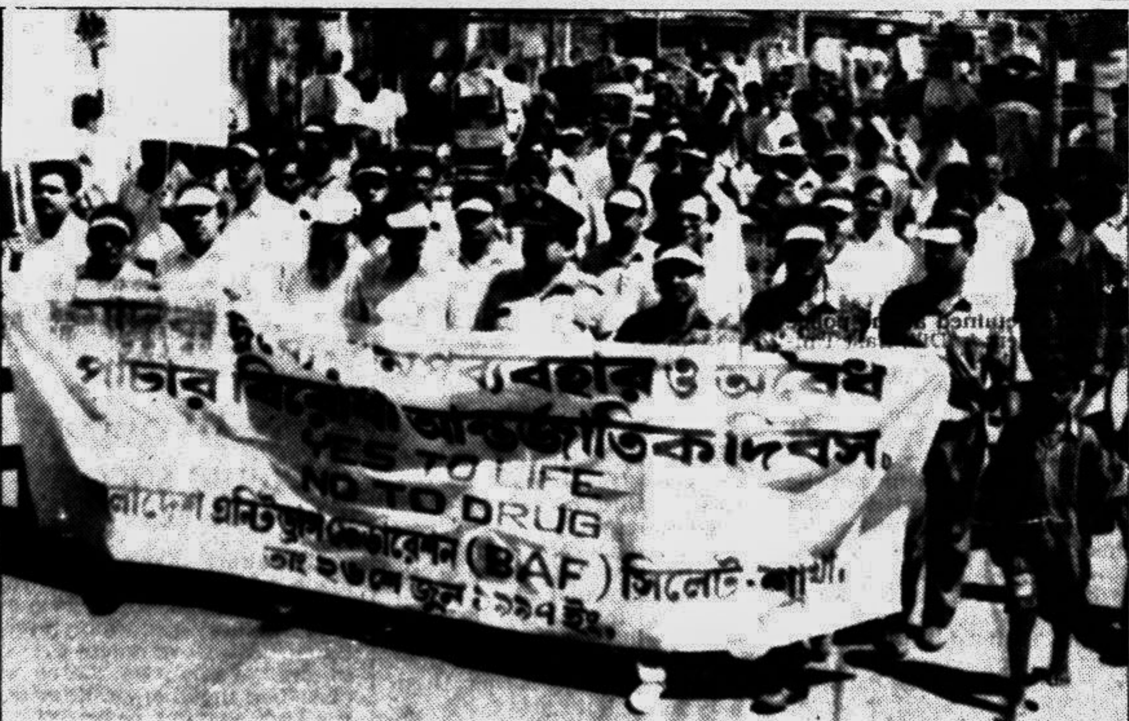
SYLHET: The International Day Against Drug Abuse was observed in the town by bringing out a colourful rally on June 26.

The machines for ultra sonography, pathology and anaesthesia have been lying out of order since long. Only one of the two ambulances is in running condition, the only X-ray machine often goes out of order causing suffering to the patients.