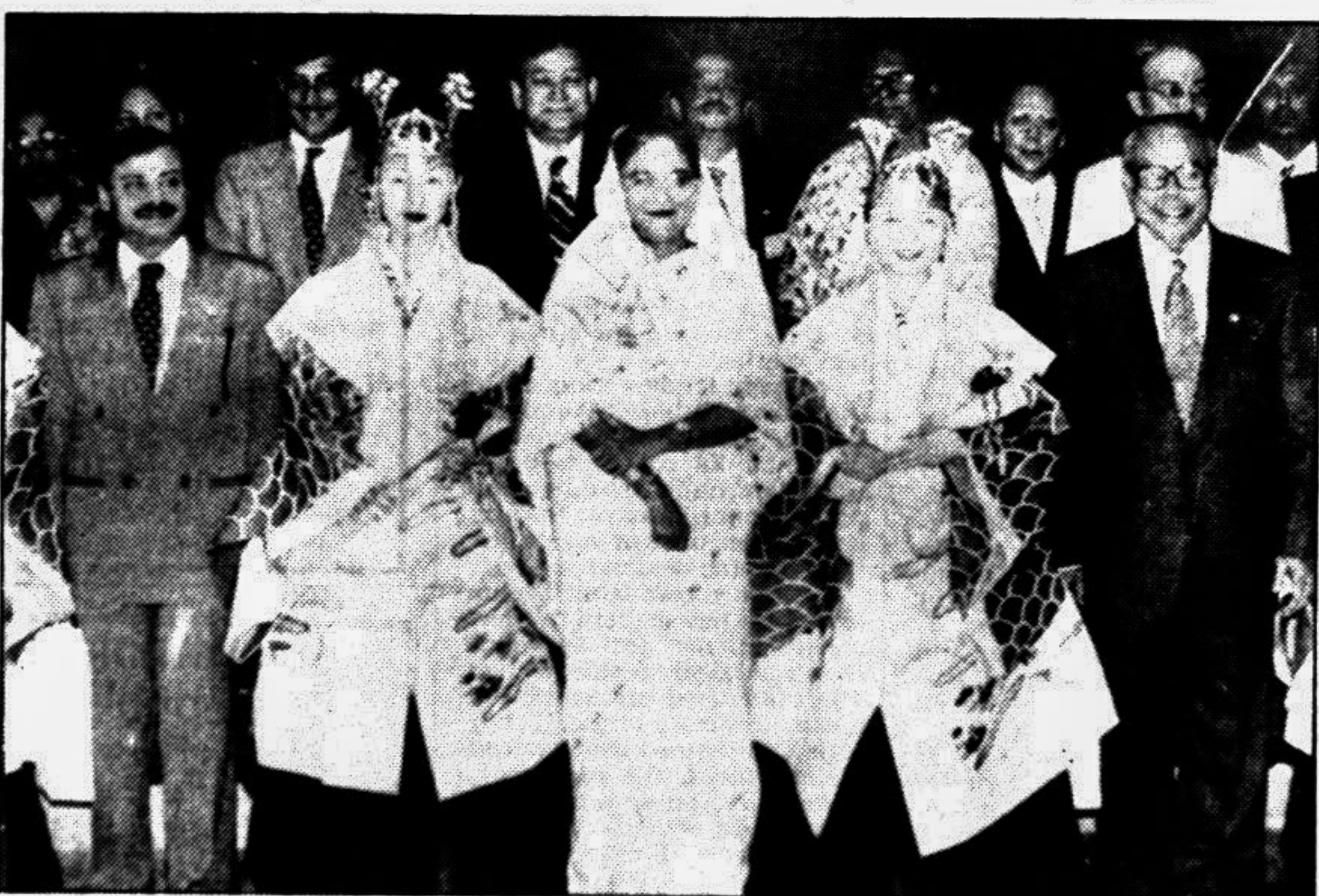
Prime Minister Sheikh Hasina visited Meiji Jingu shrine in Tokyo yesterday.

The objective of the loan agreement is to optimise the utilisation of the Jamuna Bridge by strengthening the eastern main access road section. See Page 12 Col 3