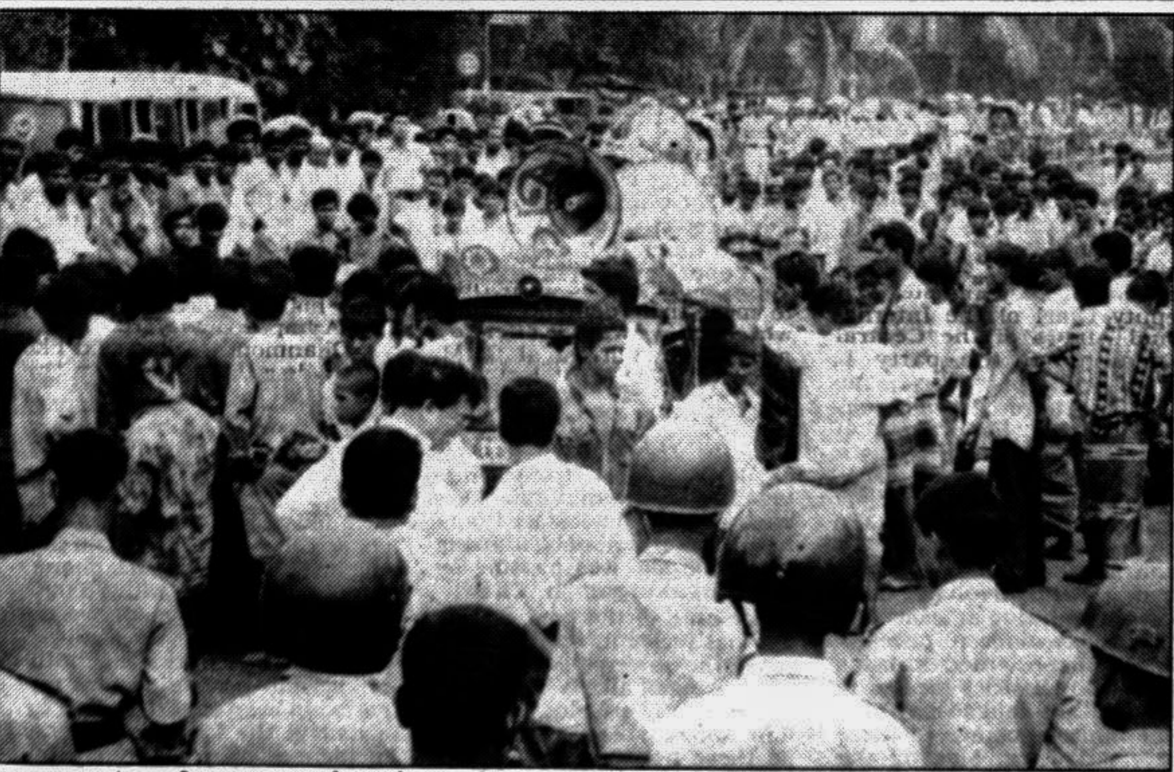
A procession of owners and workers of autorickshaws was intercepted by police near Shishu Park area on its way to the Jatiya Sangsad yesterday.

Bangladesh has achieved tremendous success in family planning programme by dramatically increasing contraceptive prevalence and decreasing total fertility rate, reports UNB. The evaluation was made yesterday by experts from home and abroad who noted that contraceptive prevalence increased from a per cent in 1975 to 49 per cent in 1997 while total fertility rate decreased from 7 in 1975 to 3.3 this year. They were speaking at a two-day dissemination seminar on 'ICDDR,B MCH-FP Extension Project (Rural)' at ICDDR,B auditorium in the city yesterday.