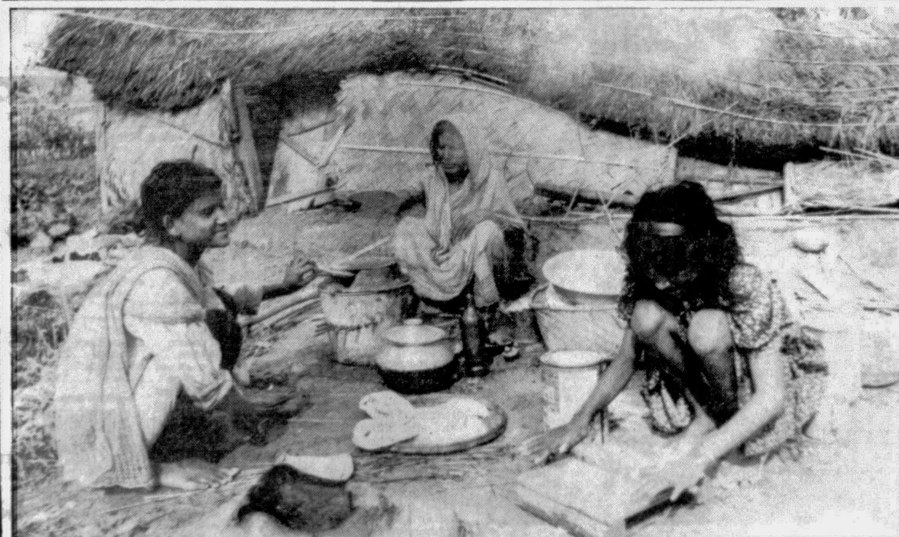
CHITTAGONG: An affected family of cyclone still living under open sky as house building materials are yet to reach them at Laldiar char in the district.