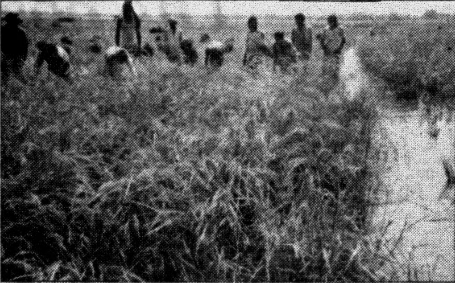
PABNA: The landless peasants of Ghughudaha who got permanent lease of 1,060 bighas of land recently are seen harvesting paddy from the land.