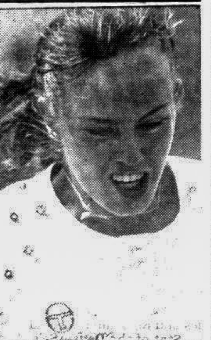
Martina Hingis (Swiss tennis star) "Me, pressure? No. I just go on court and play my best."