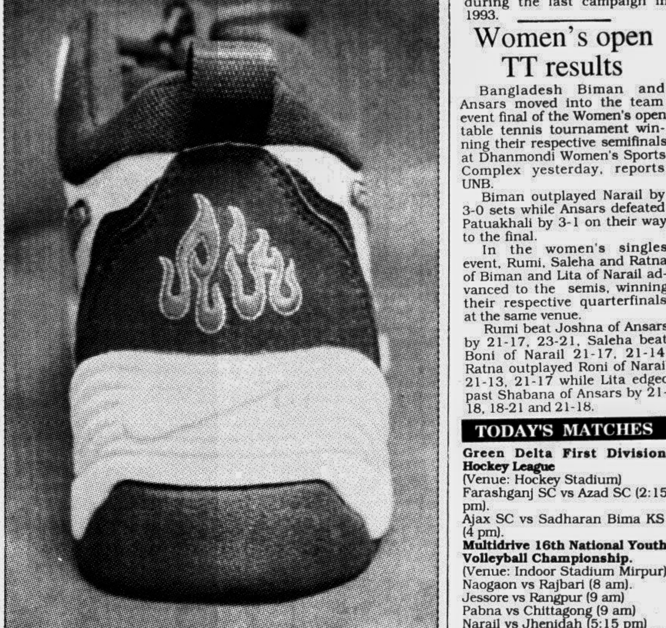
An AFP file photo taken on June 4 shows a new style Nike athletic shoe which has an 'Air' logo on it that resembles the Arabic for Allah. The logo has offended many Muslims.