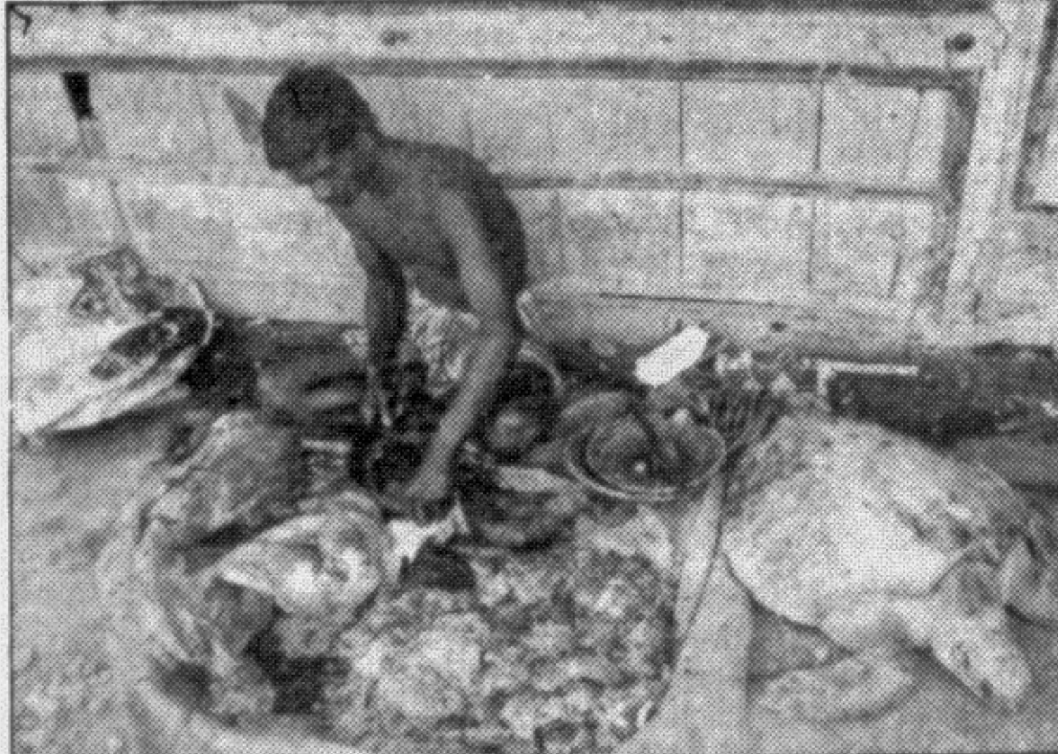
A trader is slaughtering turtles to sell the meat.