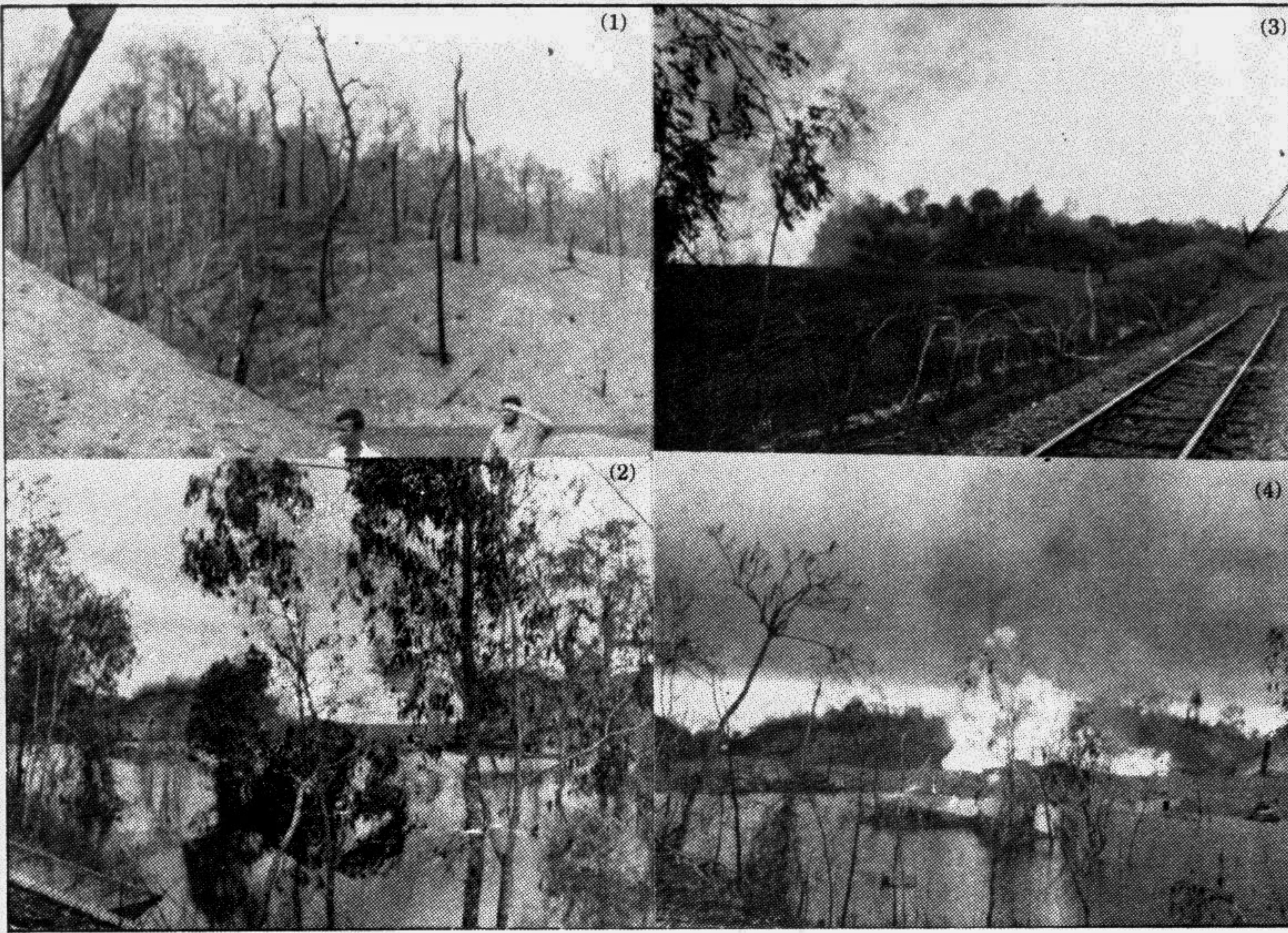
Pix 1: Huge forest resources were burnt by the devastating fire near Magurchhara gasfield. Pix 2: Water reservoirs were created five days after the huge fire. Pix 3: Sreemangal-Bhanugachh road situated near the Dhaka-Sylhet railway track cannot be located now under the heap of stones dumped after the gasfield fire incident. Pix 4: The flame came down to 20 feet on June 23.