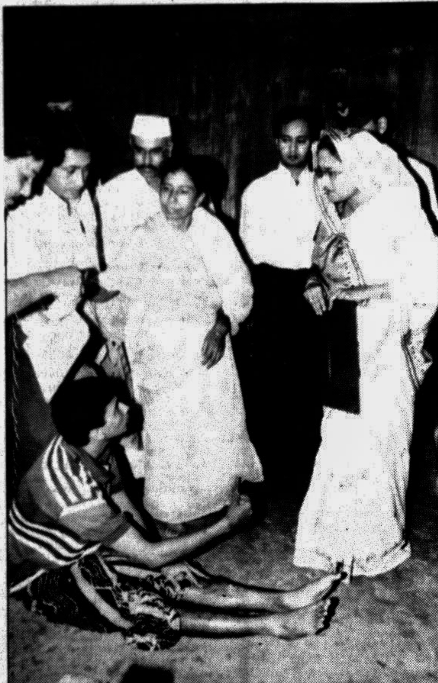
Prime Minister Sheikh Hasina listening to problems of people from different walks of life as part of her meet-the-people programme at her Sangsad Bhaban office yesterday.

A man whose 12-year-old daughter was raped and killed in 1995 met the Prime Minister yesterday to demand trial of the culprits, reports UNB.