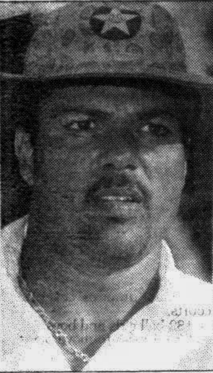
Ijaz Ahmed (Pakistani batsman) "I think my best is yet to come. In the remaining three or four seasons of my career, I hope to make the most of every opportunity and give my best to the country. Inshallah."