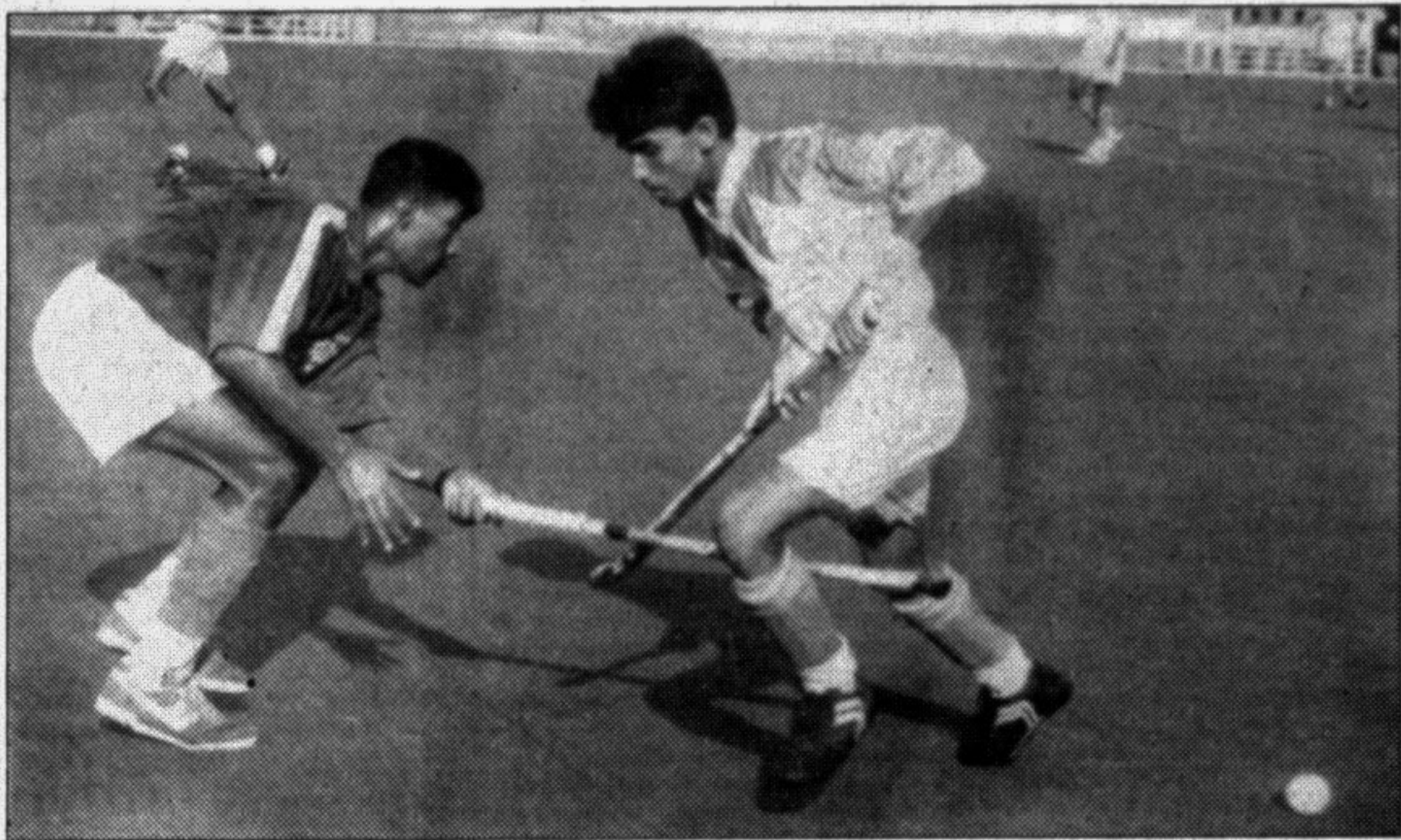
Action from yesterday's Green Delta First Division league encounter between Wari Club and Sonali Bank at the National Hockey Stadium.