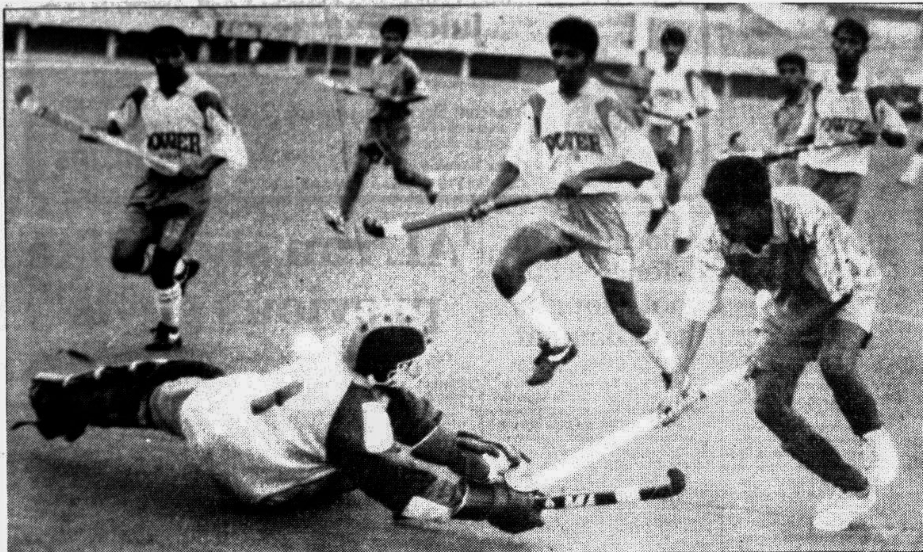
A goal-mouth scramble during the Green Delta First Division league match between Mariners and Sadharan Bima at the Hockey Stadium yesterday.