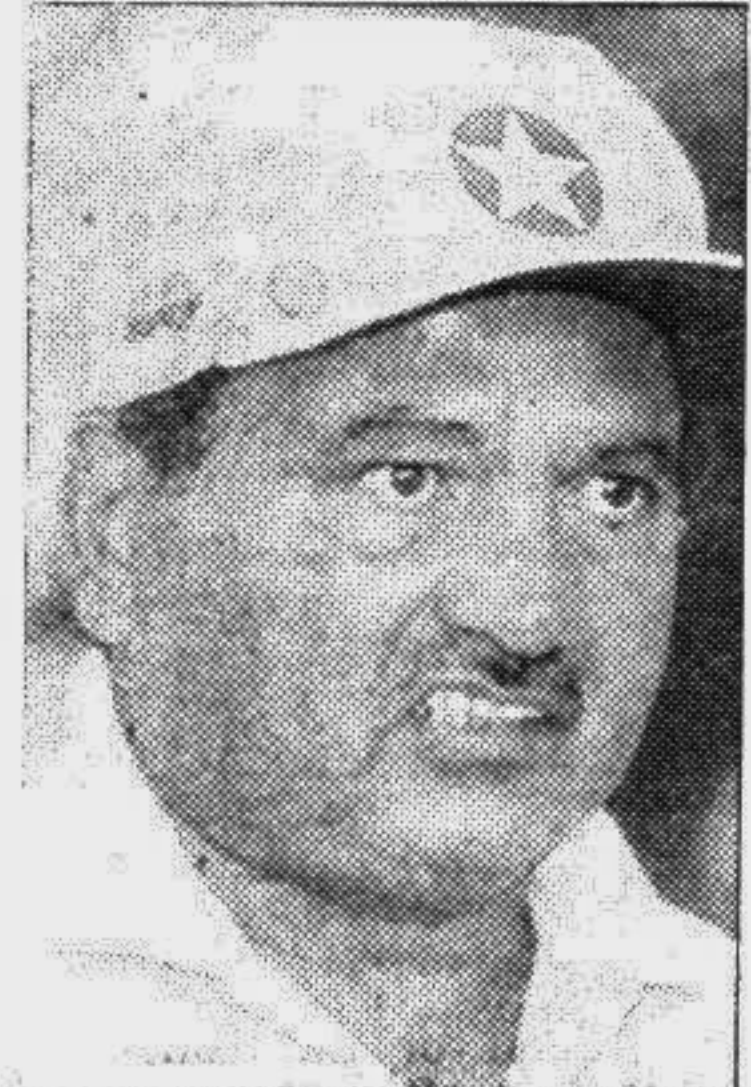
Mushtaq Mohammad (Pakistan cricket coach) "Cricket followers must learn to accept defeat. It is part of the game."