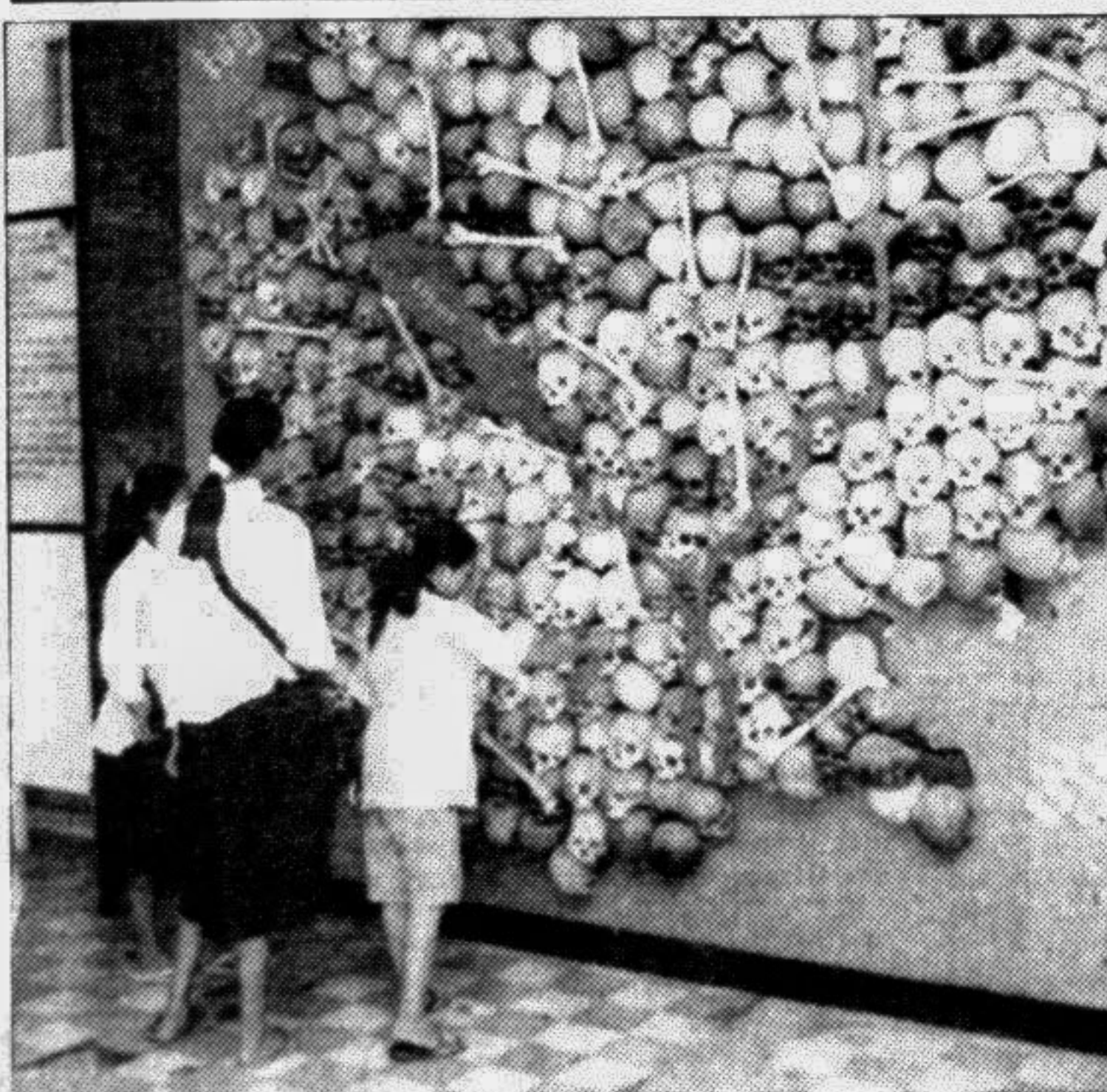
A Cambodian girl touches one of the human skulls that make up a map of Cambodia at Phnom Penh's Tuol Sleng genocide museum, a former high school that was turned into the Khmer Rouge's most notorious prison, as her friends look on in this file photo taken June 7, 1996.

The daily cautioned the two sides against "half-baked attempts (at) placating international opinion." It said "Pakistan should therefore go