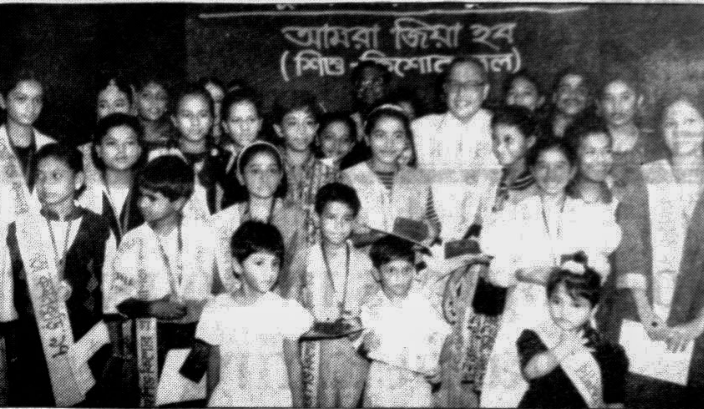
BNP leader Prof AQM Badruddoza Chowdhury distributed prizes among the winners of 'Amal Kuri '97' competition, organised by the juvenile organisation Amra Zia Hobo, at a ceremony held at the Shishu Academy yesterday.